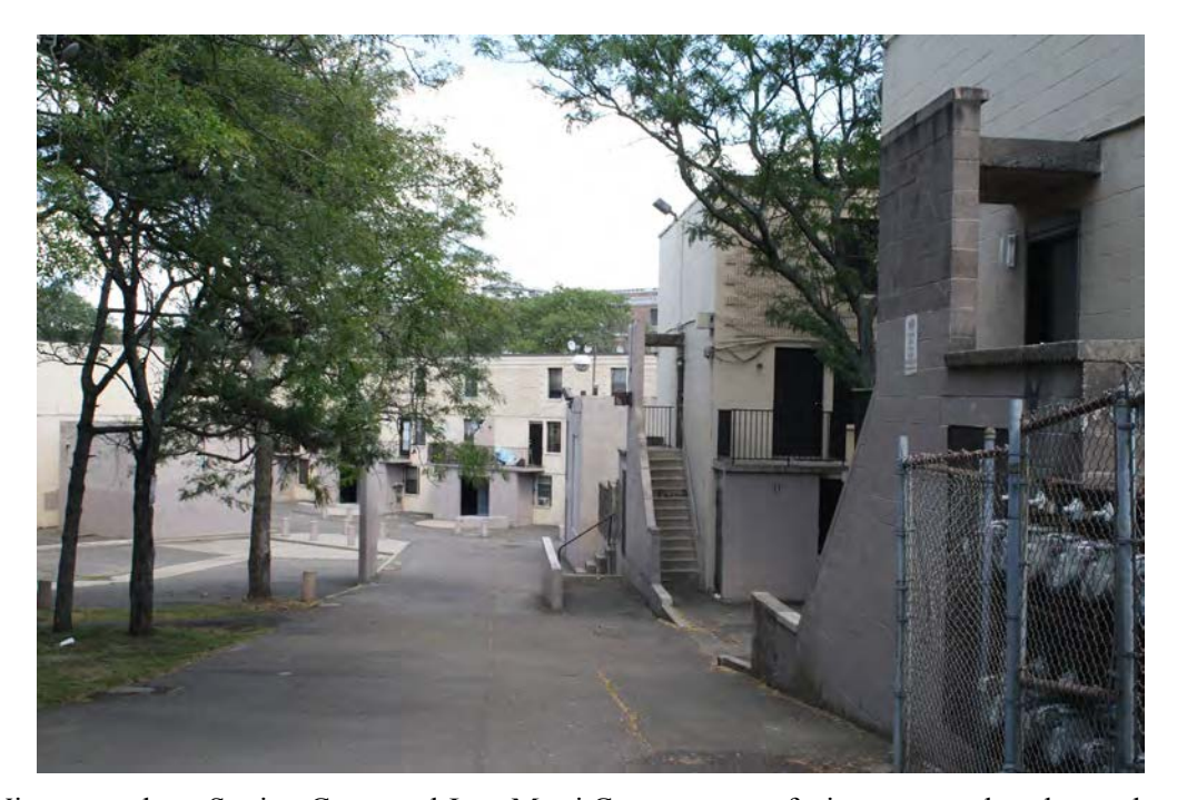
Photo 7. View east along Station Court and Jose Marti Court; camera facing east to plaza beyond.