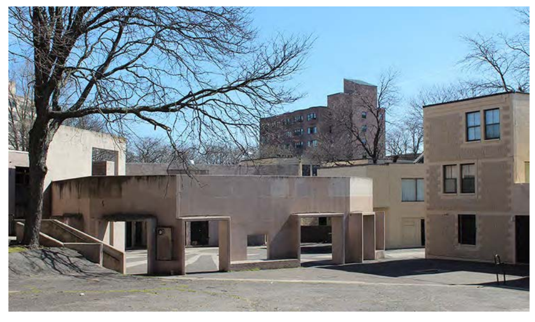
Photo 5. Northwest view of the plaza at Cinque Green; camera facing southeast.