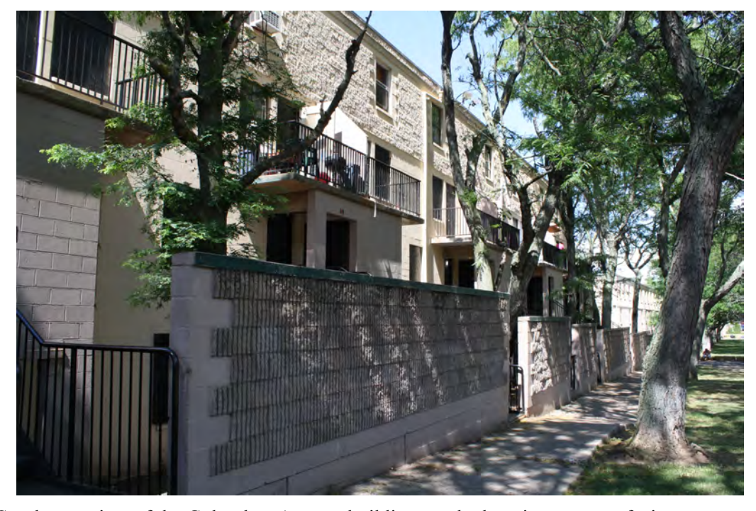
Photo 9. Southwest view of the Columbus Avenue building south elevation; camera facing east.