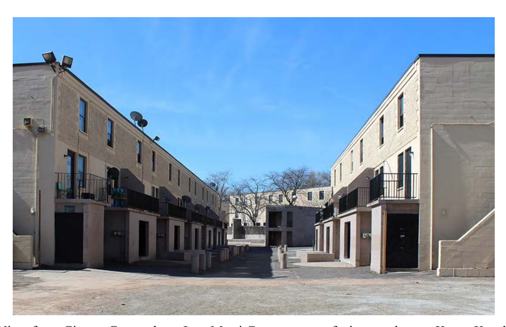
Photo 10. View from Cinque Green along Jose Marti Court; camera facing southwest.