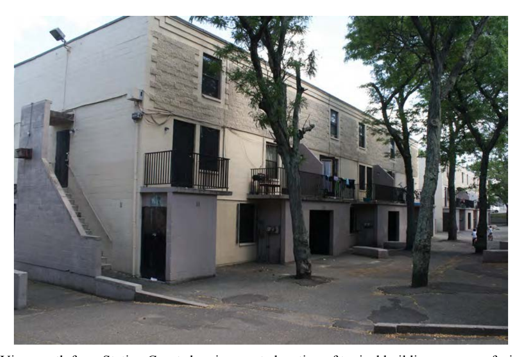
Photo 11. View south from Station Court showing west elevation of typical buildings; camera facing south.