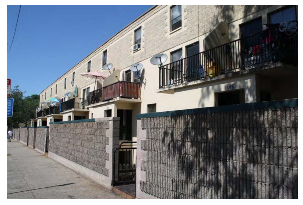
Photo 8. West view of the Church Street South building elevation; camera facing northeast.