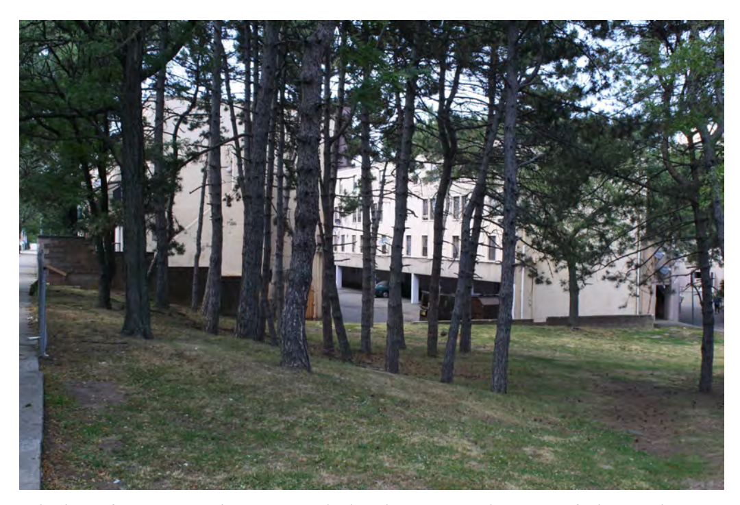
Photo 6. South view of green at Station Court and Church Street South; camera facing north.