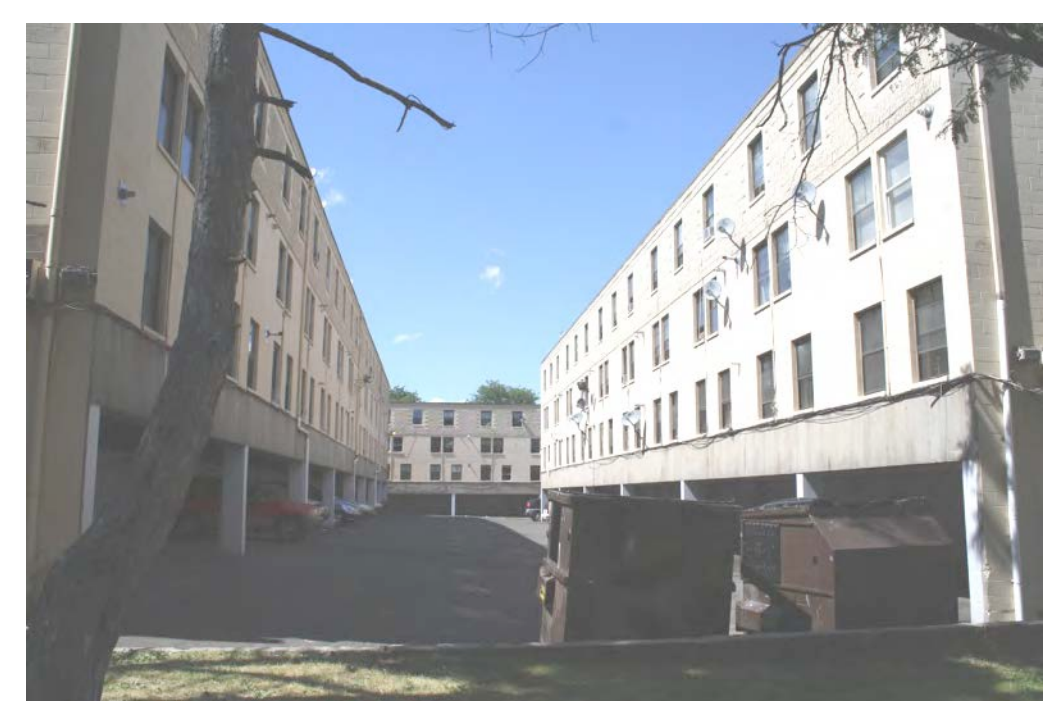
Photo 12. View north from Station Court green; camera facing north. Note the parking bays in the basement level. Both buildings have garden entrances on the opposite sides (see Photo 8).