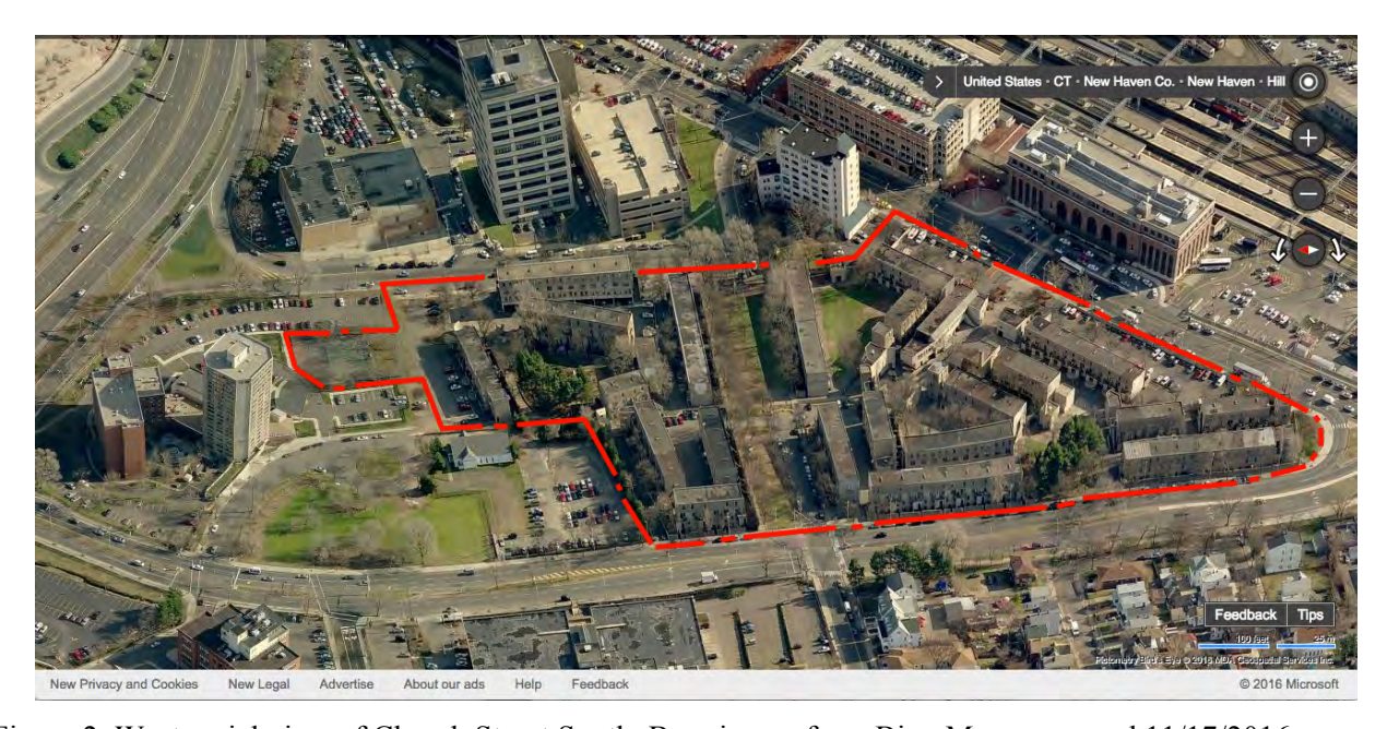
Figure 2. West aerial view of Church Street South. Base image from Bing Maps accessed 11/17/2016. Annotated to show the extent of the development site.