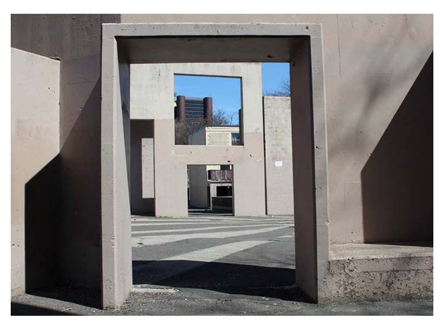
Photo 4. South view of the plaza at Cinque Green, camera facing north.