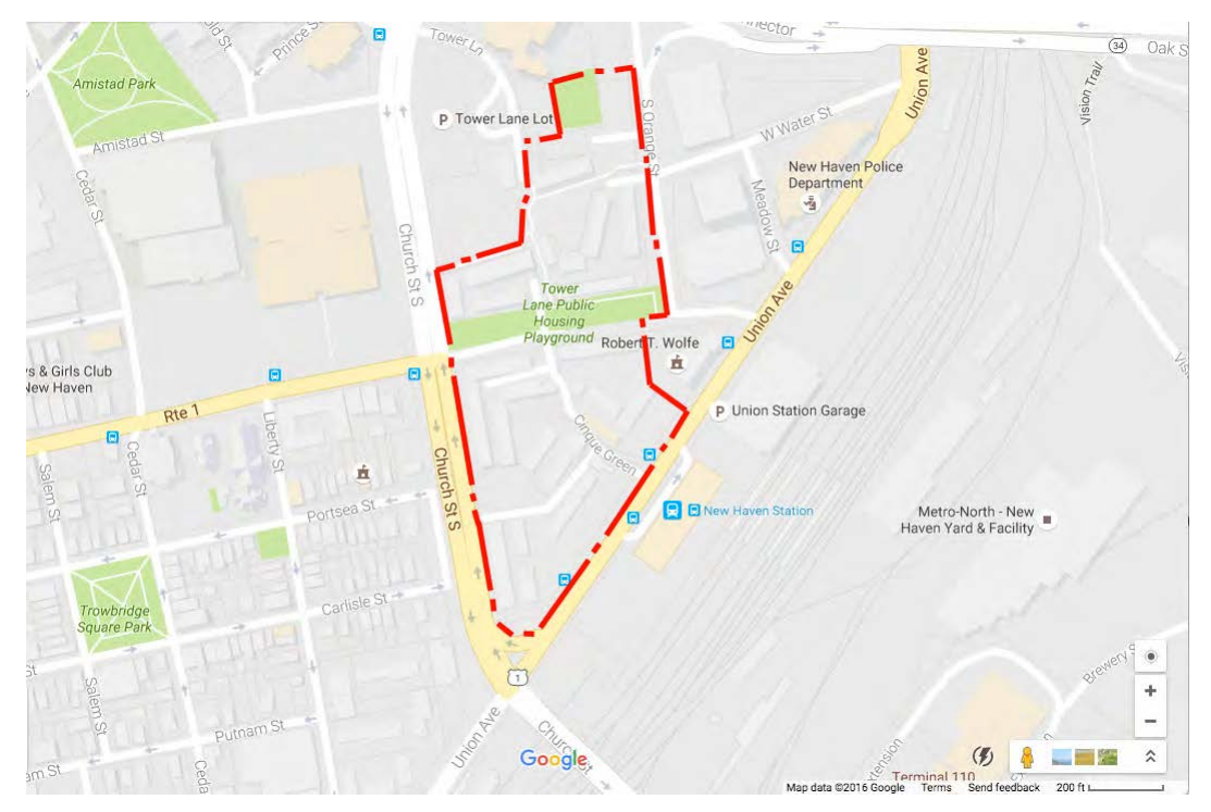
Figure 1. Location map of Church Street South. Annotated to show the extent of the development site.