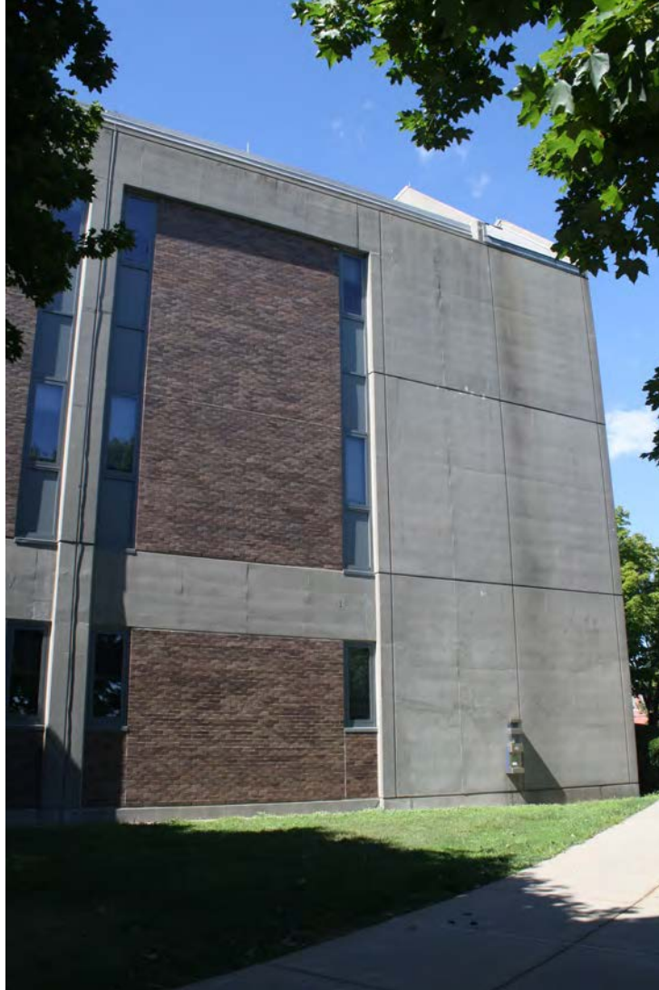
Photo 5. Exterior wall detail of the east side showing concrete frame, non-bearing brick infill, and strip windows; camera facing west.

Jennings Hall, SCSU, 501 Crescent Street, New Haven, CT