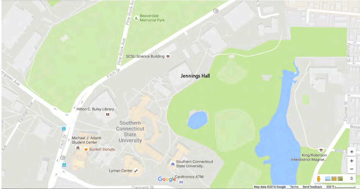
Figure 1. Location map of Jennings Hall.

Jennings Hall, SCSU, 501 Crescent Street, New Haven, CT