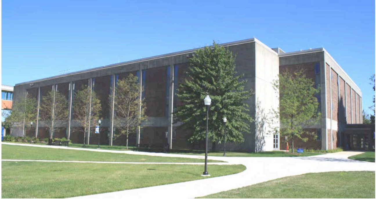
Photo 3. Southwest view of Jennings Hall, camera facing northeast.

Jennings Hall, SCSU, 501 Crescent Street, New Haven, CT