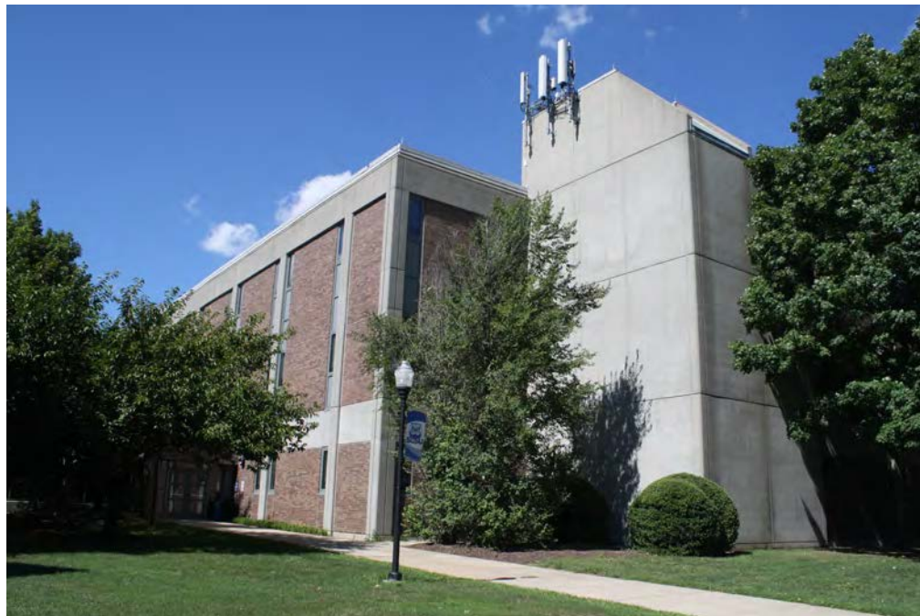
Photo 4. Southeast detail view of Jennings Hall, camera facing northwest.