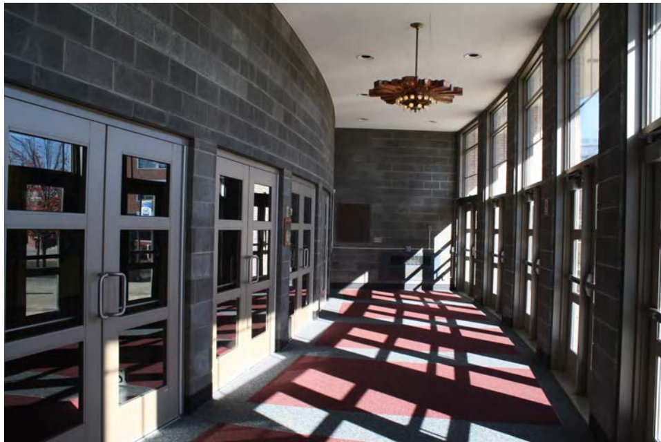
Photo 6. Interior view of entrance vestibule; camera facing north.