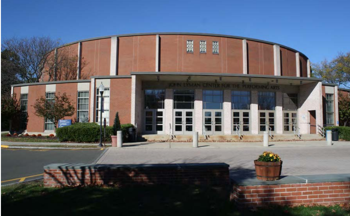
Photo 3. East view of John Lyman Center Auditorium, camera facing west.

John Lyman Center, SCSU, 501 Crescent Street, New Haven, CT