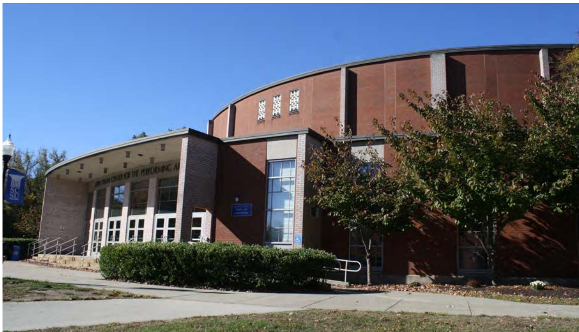
Photo 4. Northeast view of John Lyman Center Auditorium, camera facing southwest.