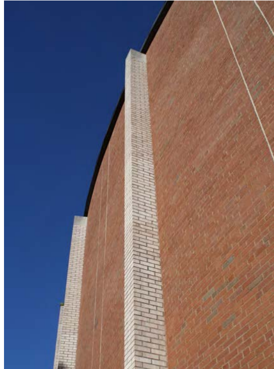
Photo 5. Exterior wall detail of the south side showing contrasting brick pilasters; camera facing west.

John Lyman Center, SCSU, 501 Crescent Street, New Haven, CT