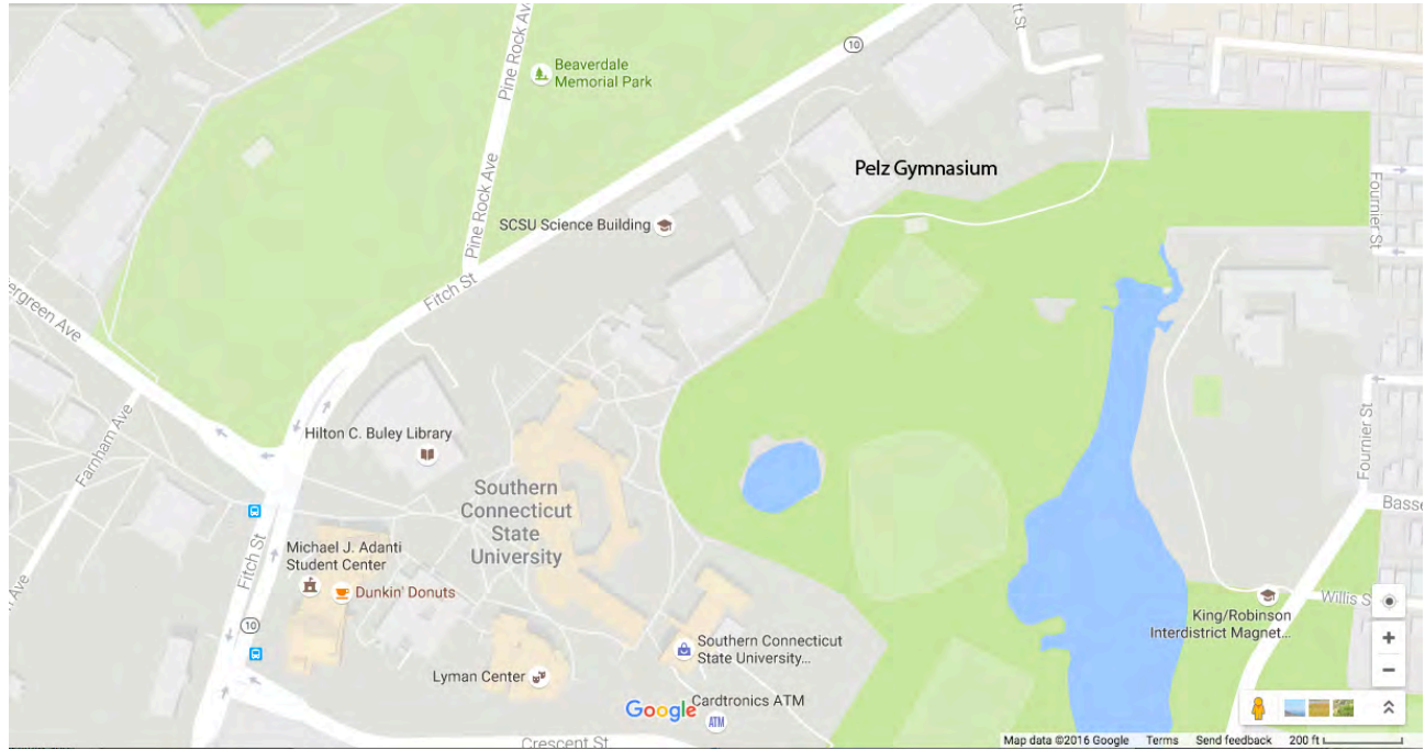
Figure 1. Location map of Pelz Gymnasium. Image from Google Maps accessed 10/27/2016.

Pelz Gymnasium, SCSU, 501 Crescent Street, New Haven, CT