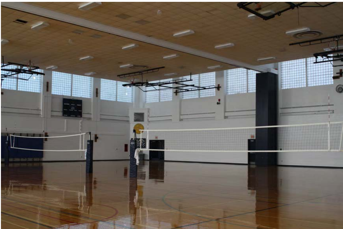
Photo 6. Interior view of the large gym in the west block (1952); camera facing northwest.