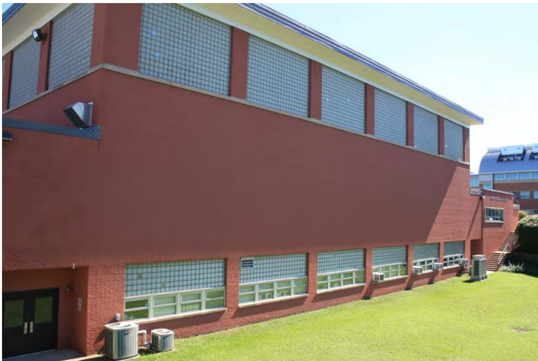
Photo 4. Northwest view of Pelz Gymnasium, camera facing southeast. This is the west elevation of the 1952 building, consisting of a gymnasium at the upper level and classrooms below facing a sunken exterior landscaped area.