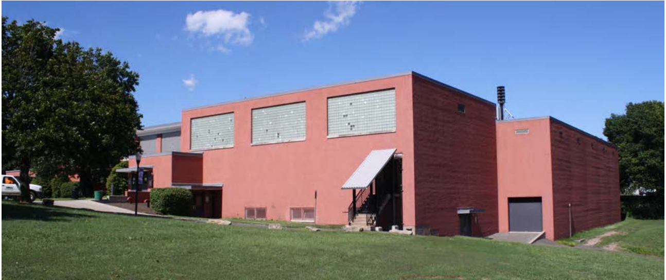
Photo 5. Southeast view of Pelz Gymnasium; camera facing northwest. This 1958 block consists of the swimming pool at right rear and a small gym on an upper level over support spaces at the foreground.

Pelz Gymnasium, SCSU, 501 Crescent Street, New Haven, CT