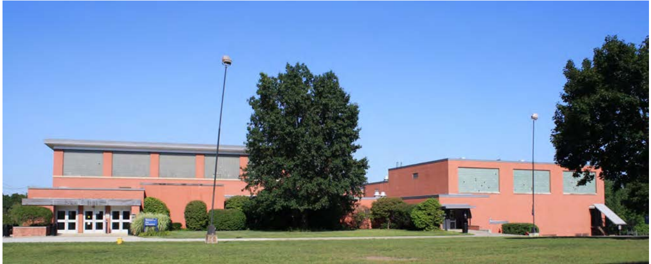
Photo 3. South view of Pelz Gymnasium, camera facing north. The west (left) block dates from 1952; the east (right) block was added in 1958, with further additions in 1972.

Pelz Gymnasium, SCSU, 501 Crescent Street, New Haven, CT