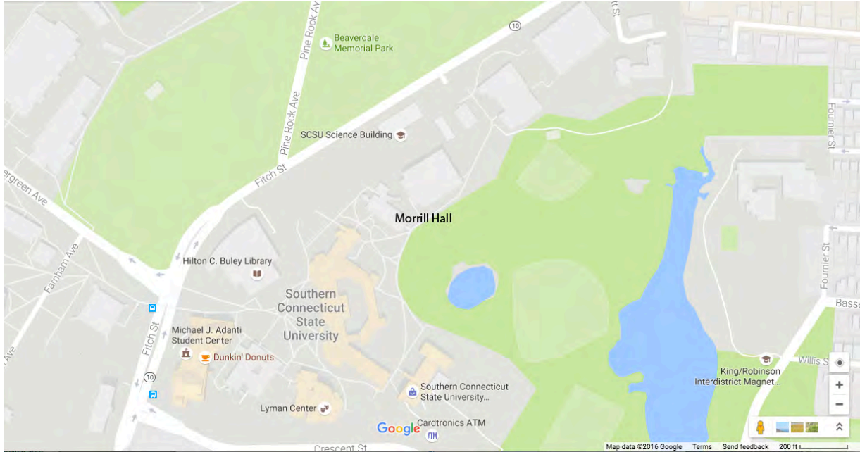
Figure 1. Location map of Morrill Hall.

Morrill Hall, SCSU, 501 Crescent Street, New Haven, CT