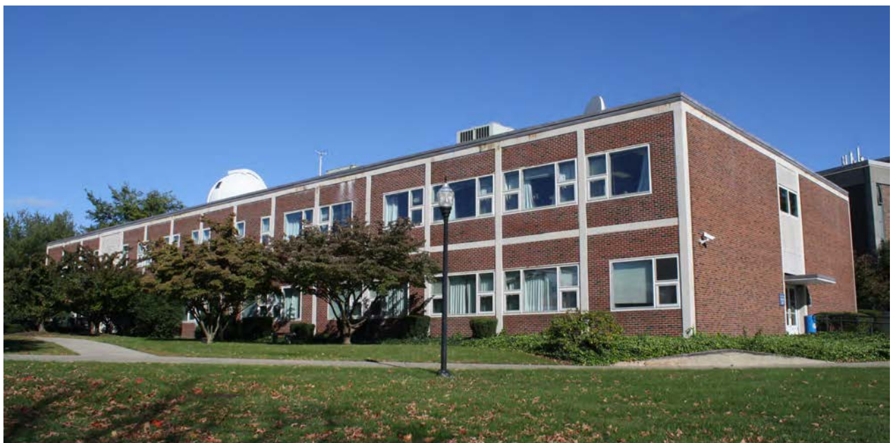
Photo 4. Southeast view of Morrill Hall, camera facing northwest.