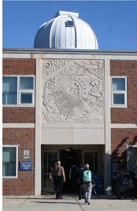
Photo 5. Exterior wall detail of the south side showing Symbols of Man by Charles Grabarek.

Morrill Hall, SCSU, 501 Crescent Street, New Haven, CT