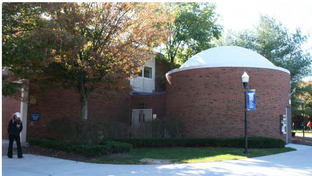
Photo 6. Northwest view of the planetarium wing; camera facing southeast.