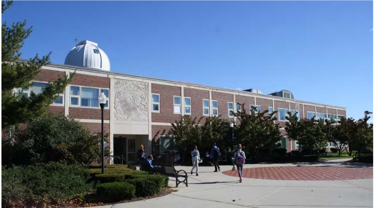
Photo 3. South view of Morrill Hall, camera facing northeast.

Morrill Hall, SCSU, 501 Crescent Street, New Haven, CT