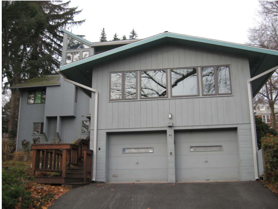
1. E view from Autumn Street, camera facing west.