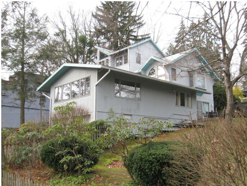
2. NE view from Autumn Street, camera facing southwest