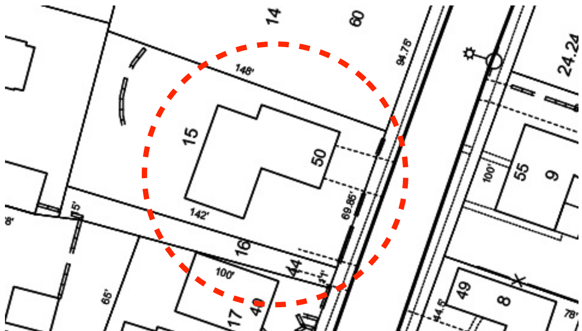
4. Site Plan – detail from City of New Haven Tax Map 219/459/015.