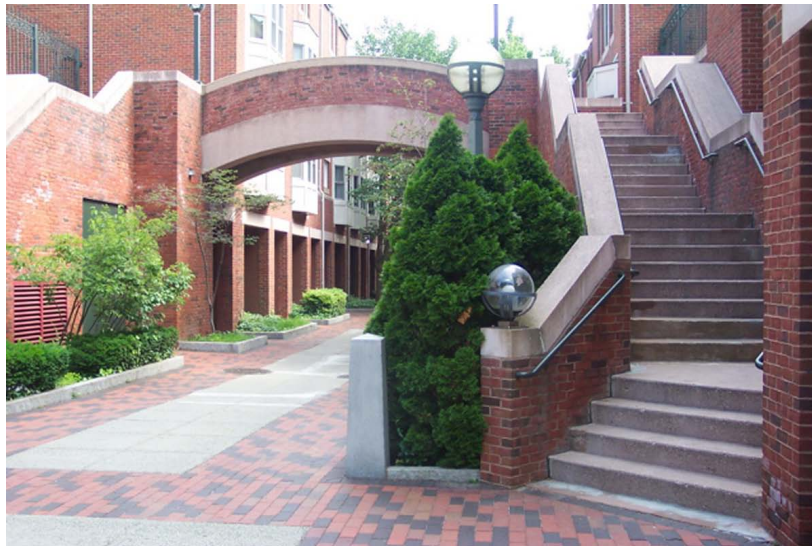
1. South view of Lincoln Street walkway from Audubon Street, camera facing north.