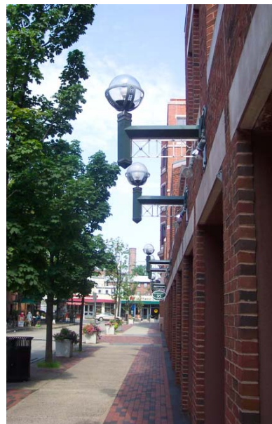
3. Street front with lighting and signs, facing west.