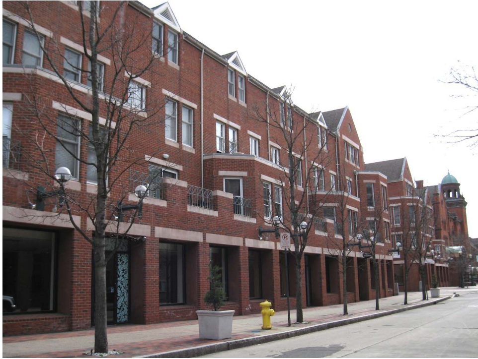
4. Southwest view, camera facing northeast.