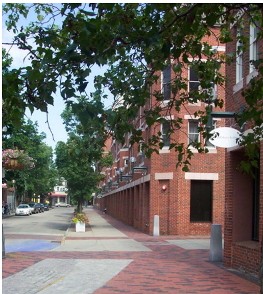
2. Southeast view from plaza, camera facing west