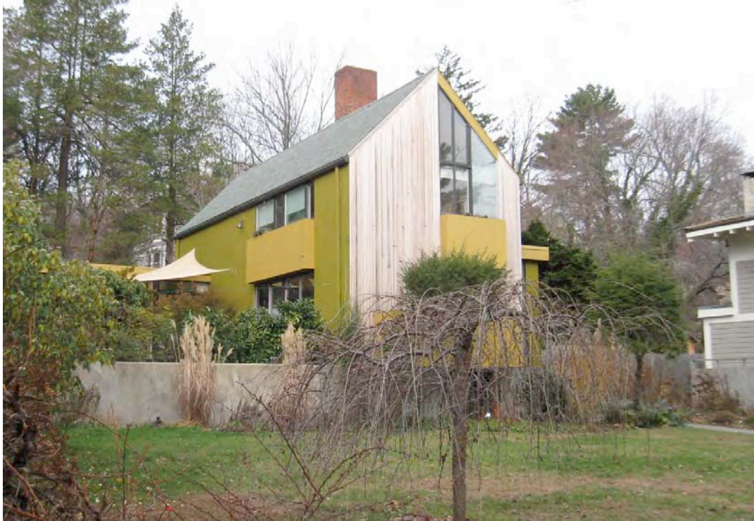
1. SW view from Autumn Street, camera facing northeast.