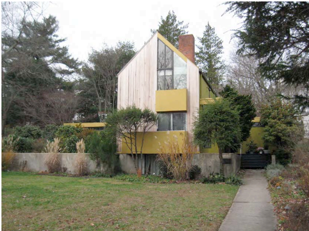
2. NW view from Autumn Street, camera facing southwest