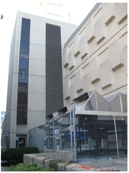
4. South side abutting tunnel, camera facing northwest.