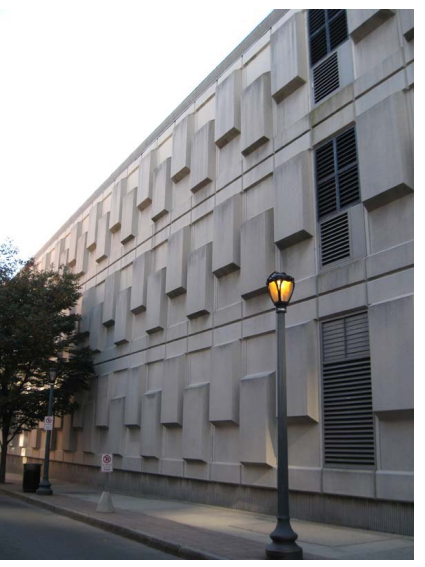
3. North wall facing Court Street, camera facing southeast.