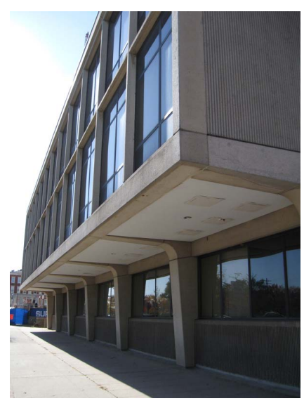
2. Northeast view, camera facing south.