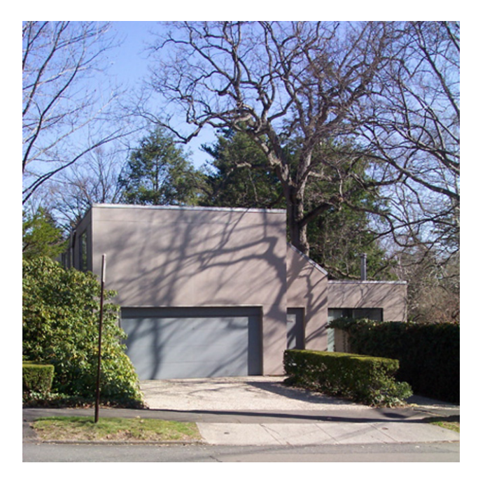
1. South view from Ogden Street, camera facing north.