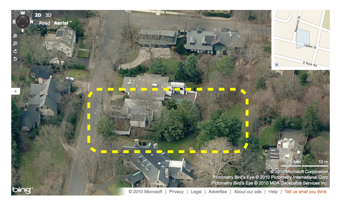
2. Southeast view from Ogden Street, camera facing northwest.

3. East aerial view, from Bing Maps <a href="http://www.bing.com/maps/">http://www.bing.com/maps/</a>, accessed 5/20/2010.