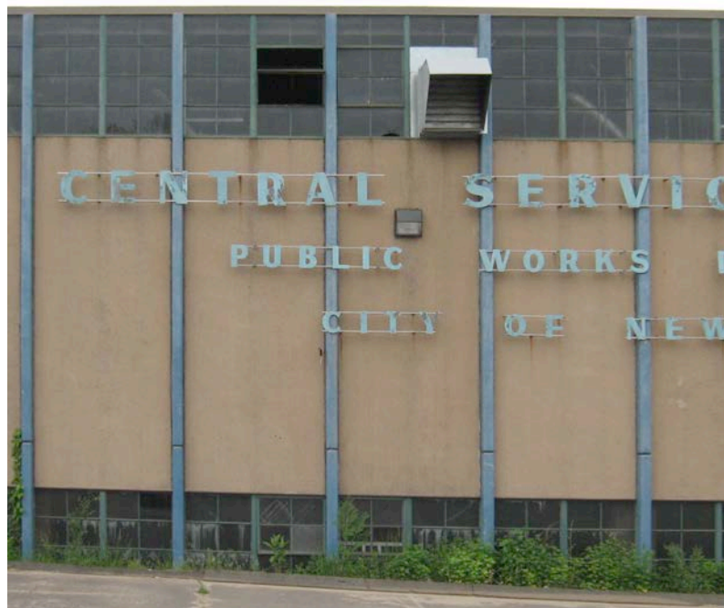
4. South detail view, camera facing north.