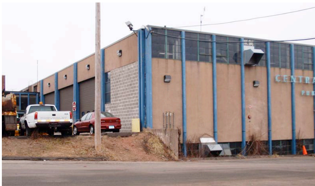
2. Southwest view from street, camera facing northeast.