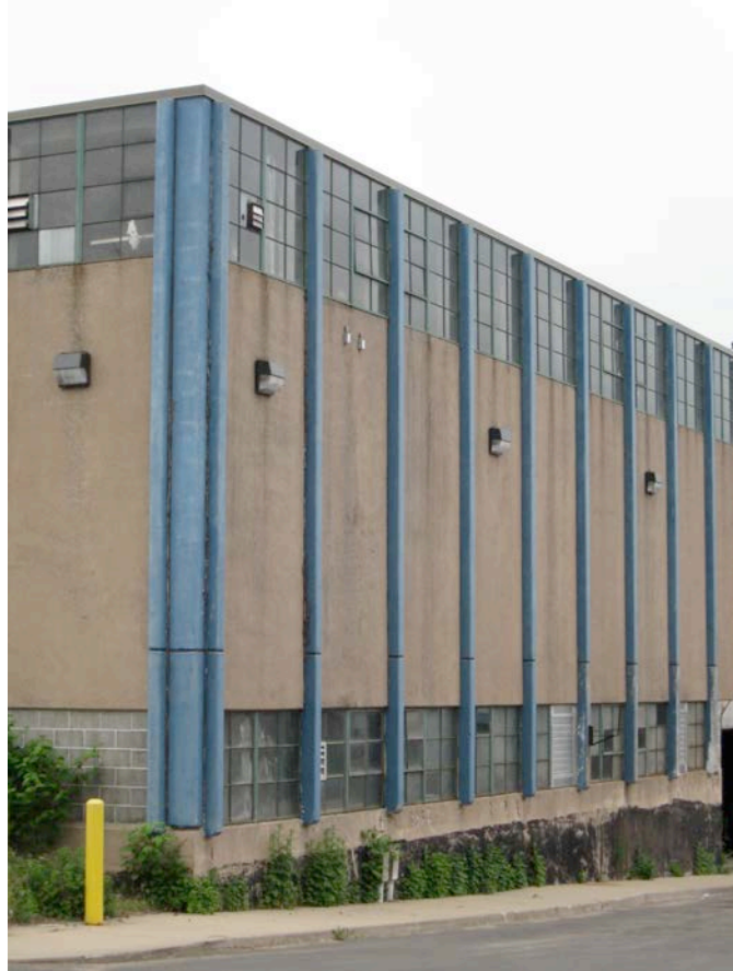
3. Southeast view from street, camera facing northwest.