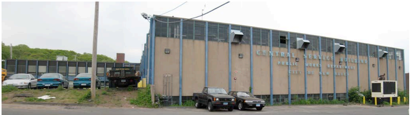
1. South view, camera facing north.

Biographical background on Carleton Granbery: courtesy of William Raveis Real Estate - anthony.ardino@raveis.com