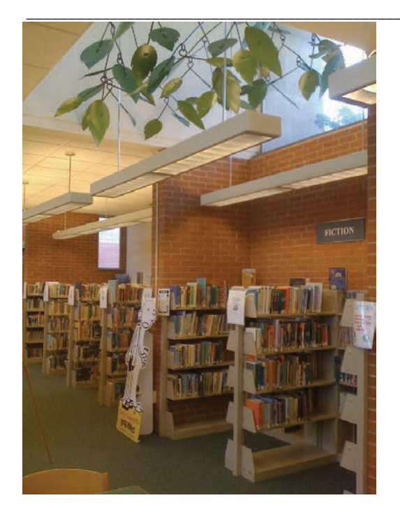
3. Interior of children's wing showing clerestory lighting.