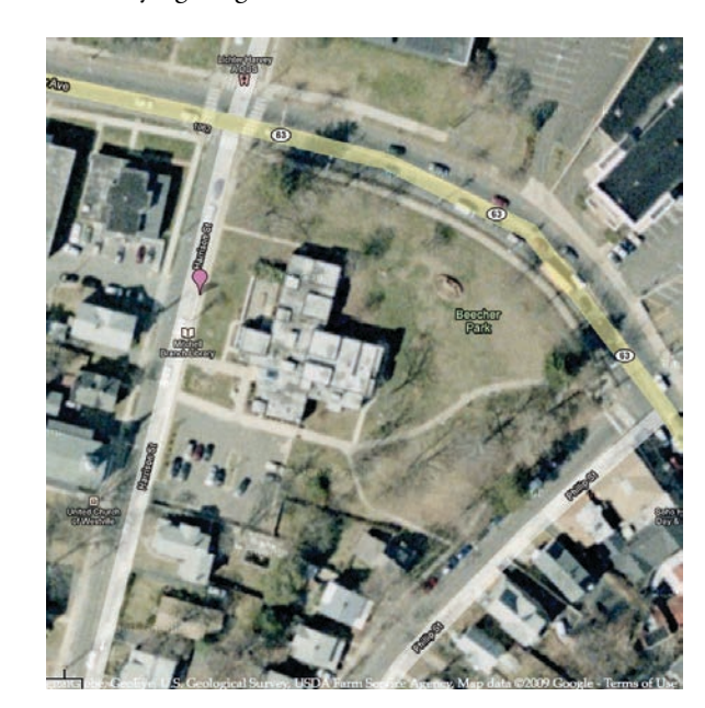
West aerial view from Bing Maps http://www.bing.com/maps/ accessed 11/10/2010.