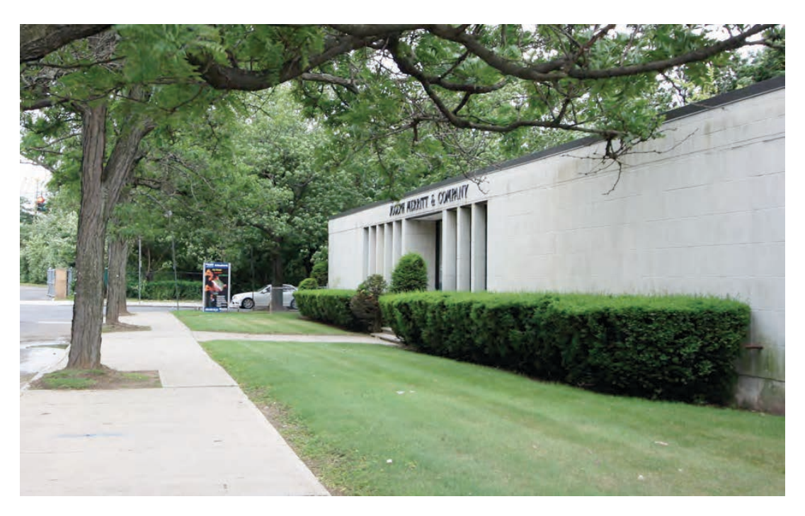
Noth sviewfon Hamil & tre g meaficg we.