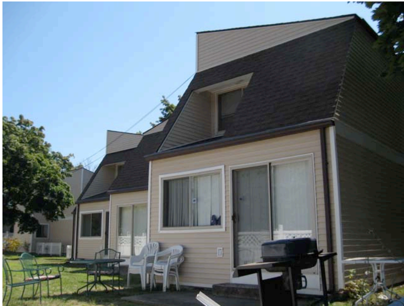
1. N View of Goffe Street side, camera facing southeast.

http://www.cthistoryonline.org/cdm4/item_viewer.php?CISOROOT=/cho&CISOPTR=14205&CISOBOX=1&REC=3