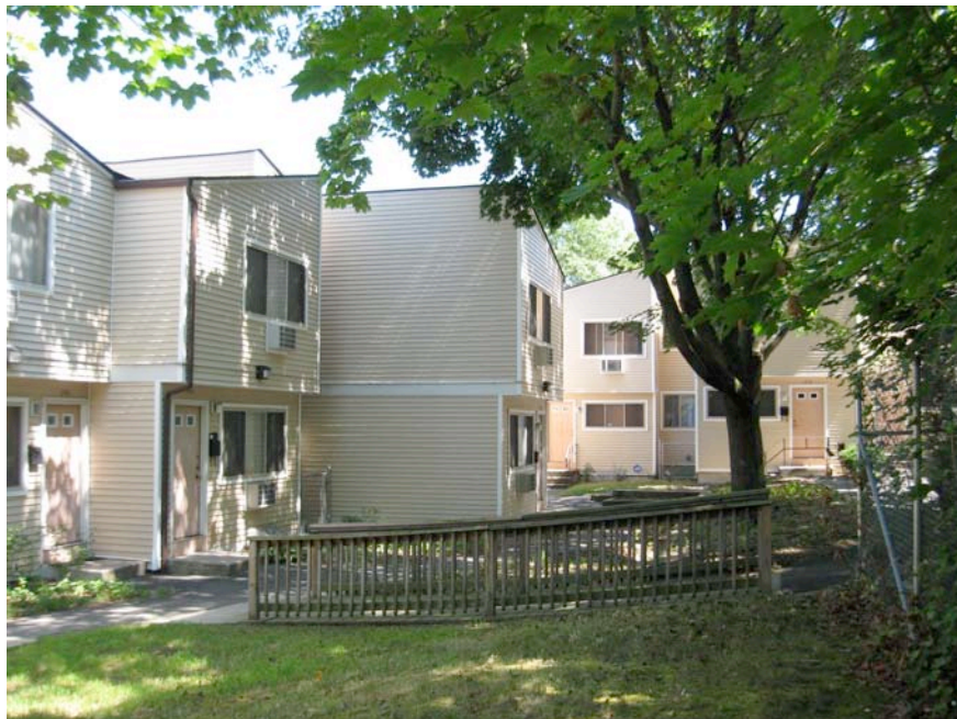
3. Southwest view of interior of site and parking, camera facing northeast.