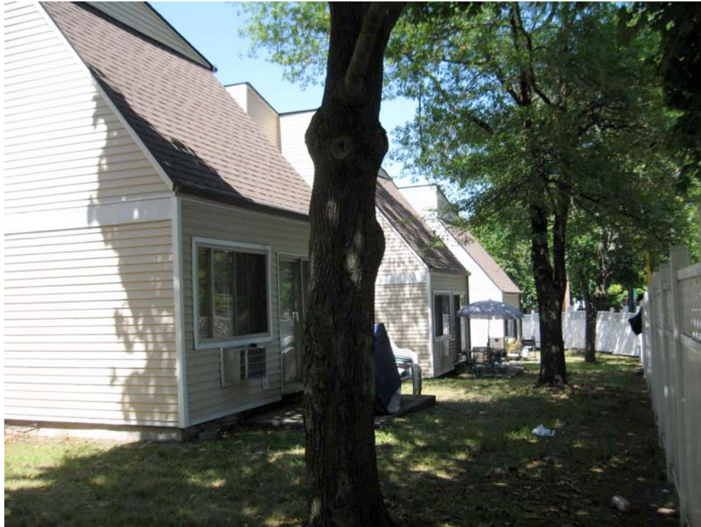
4. South view from Orchard Street, camera facing north.