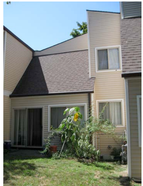
2. E view of Orchard Street side, camera facing west.