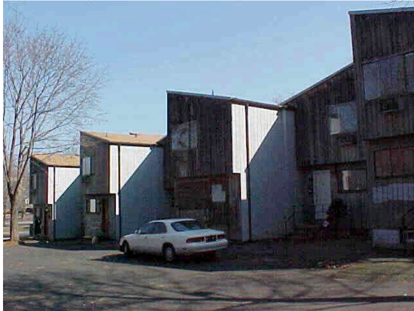
6. New Haven Assessor's Record photograph showing wood siding before installation of vinyl.