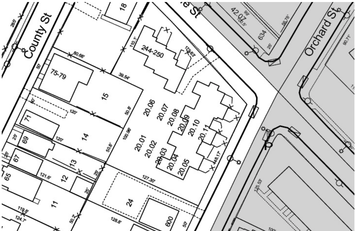
7. Site Plan – from City of New Haven Tax Map 320/0300/02001-020011, not to scale, North ↑.