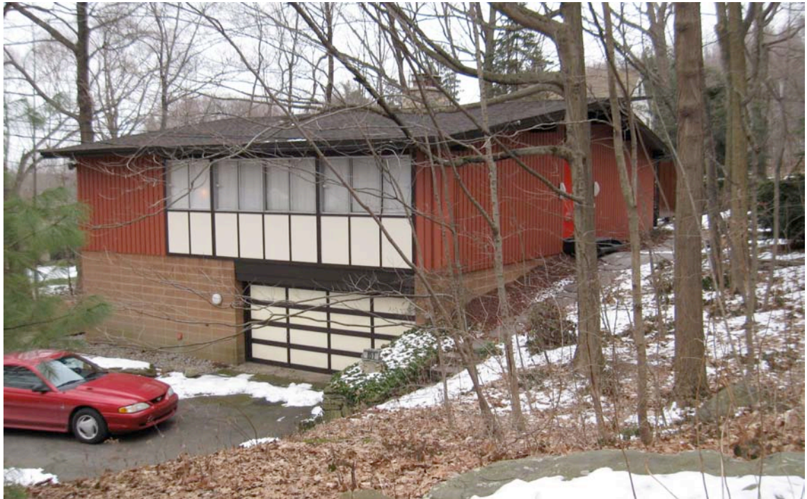
3. Northwest View from Cleveland Road – camera facing southeast.