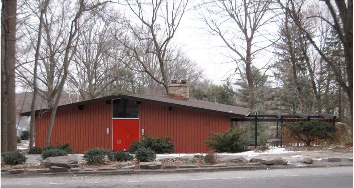
1. West view from Forest Road, camera facing east.