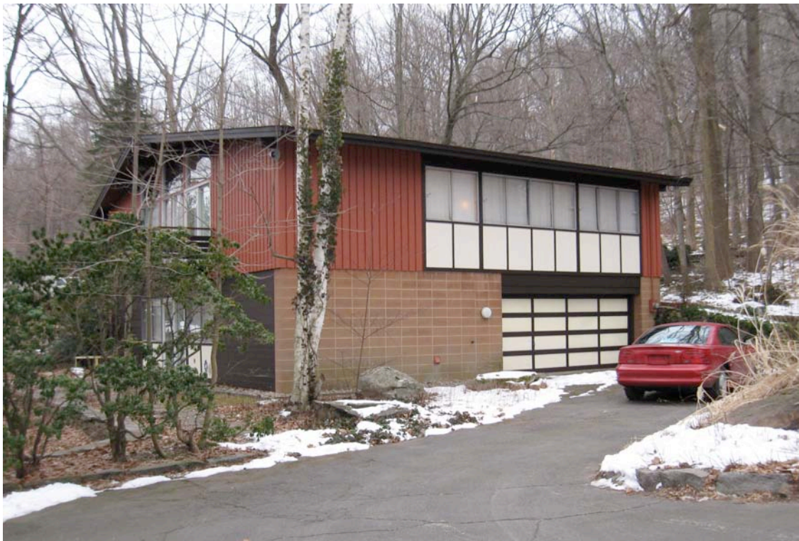
2. Northeast view from Cleveland Road, camera facing southwest