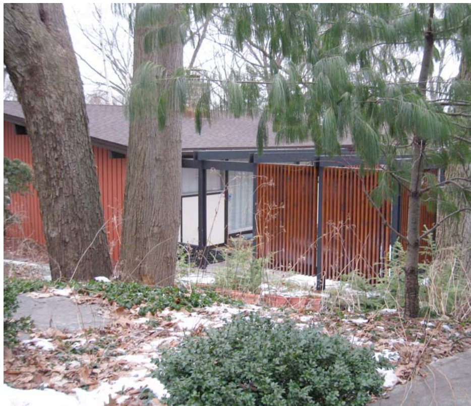
4. Southwest view from Forest Road showing screen and trellis – camera facing northeast.