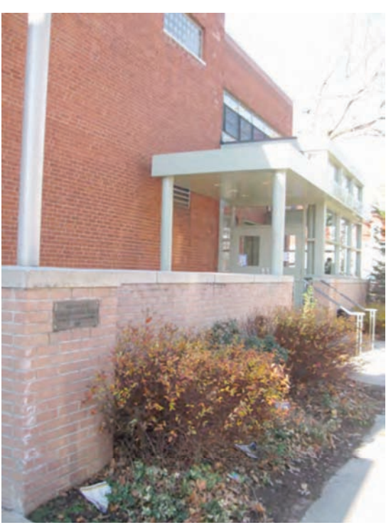
2. East view of Fillmore Street façade and entry, Camera facing northwest.