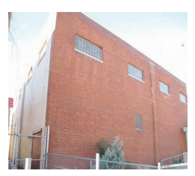
1. Southeast view of Fillmore Street façade and south wall, camera facing west.