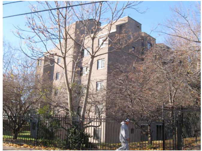
3. Southeast (left) and east (right) views of southwest wing, camera facing northwest.