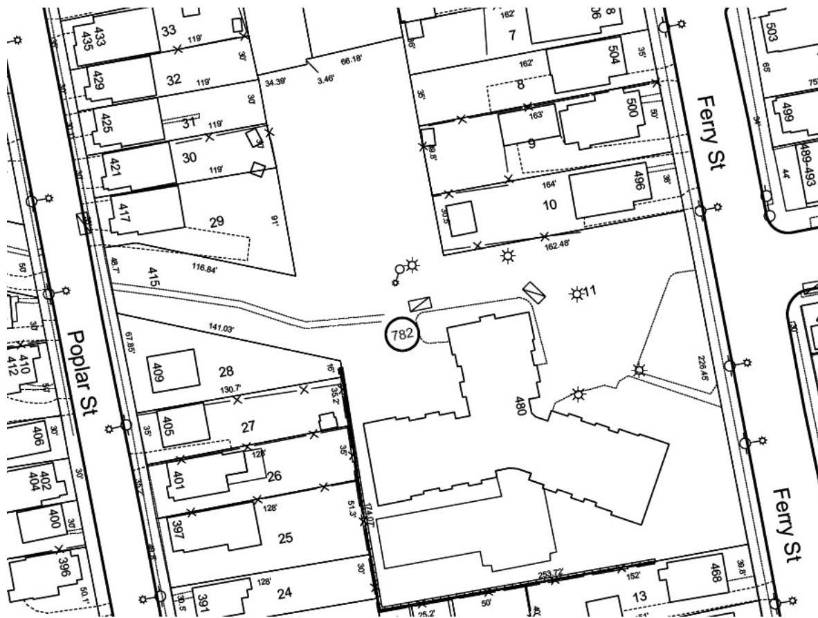
5. Site Plan – detail from City of New Haven Tax Map 168/782/011, not to scale, North ↑.