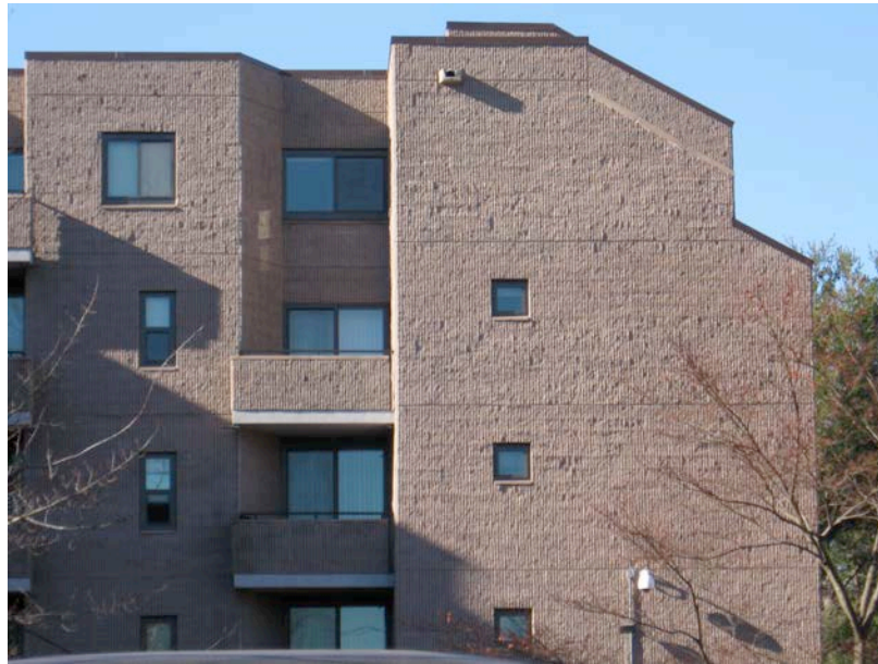
1. East detail view from Ferry Street, camera facing west.

http://www.wardmaps.com/viewasset.php?aid=73