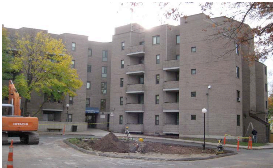
2. Northeast view from entrance drive, camera facing southwest.