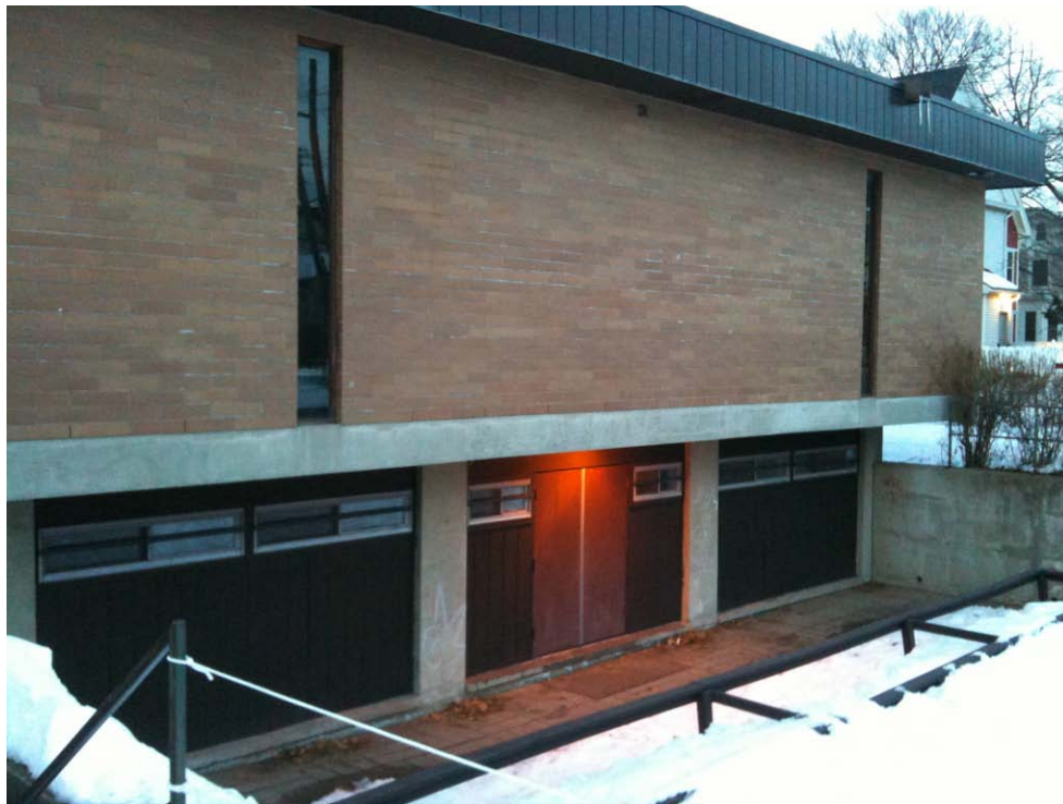
4. South view of sanctuary and Basement level with sunken courtyard, camera facing northeast.