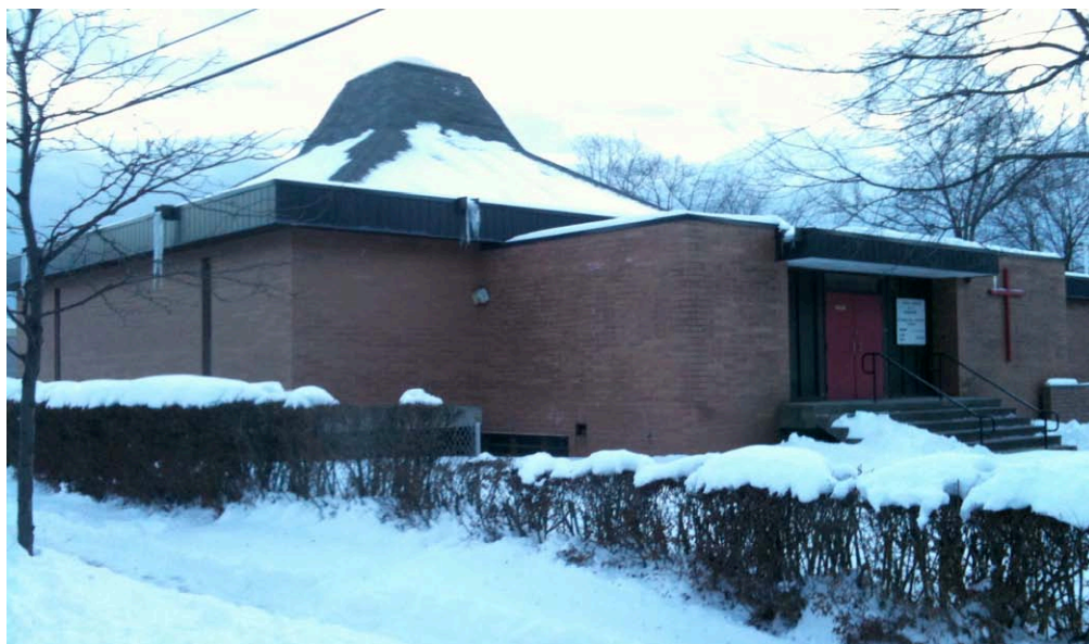
2. Northeast view from Ward and Davenport, camera facing southwest.