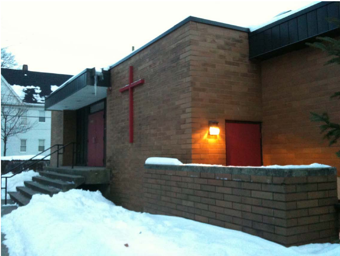
1. North view of entrance from Davenport Avenue, camera facing southeast.