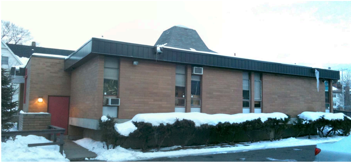
3. West view from parking, camera facing east.