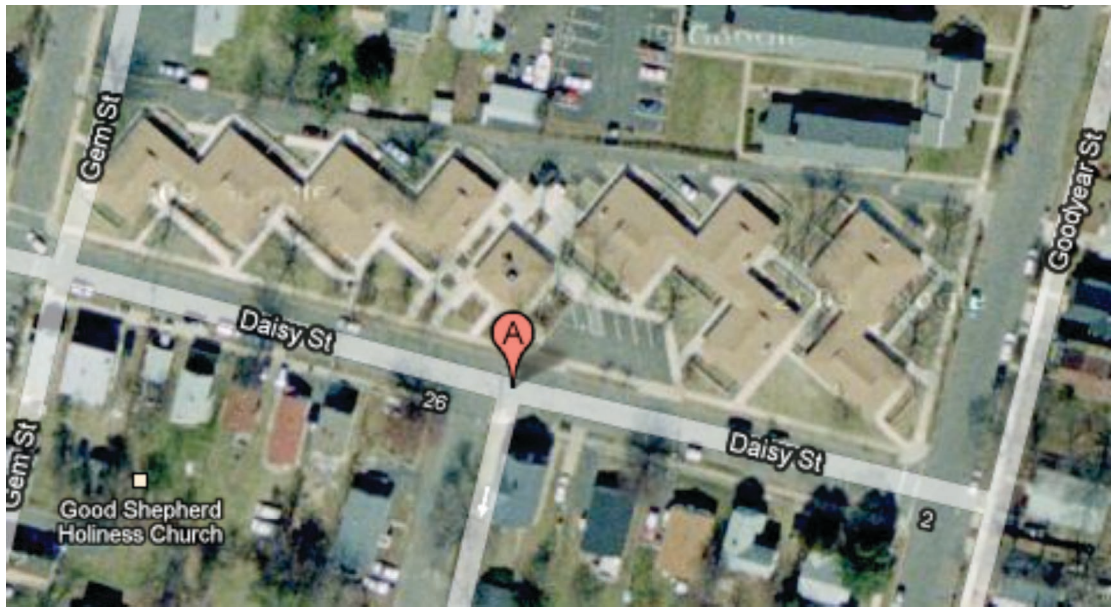
Google map satellite view showing staggered building footprint.