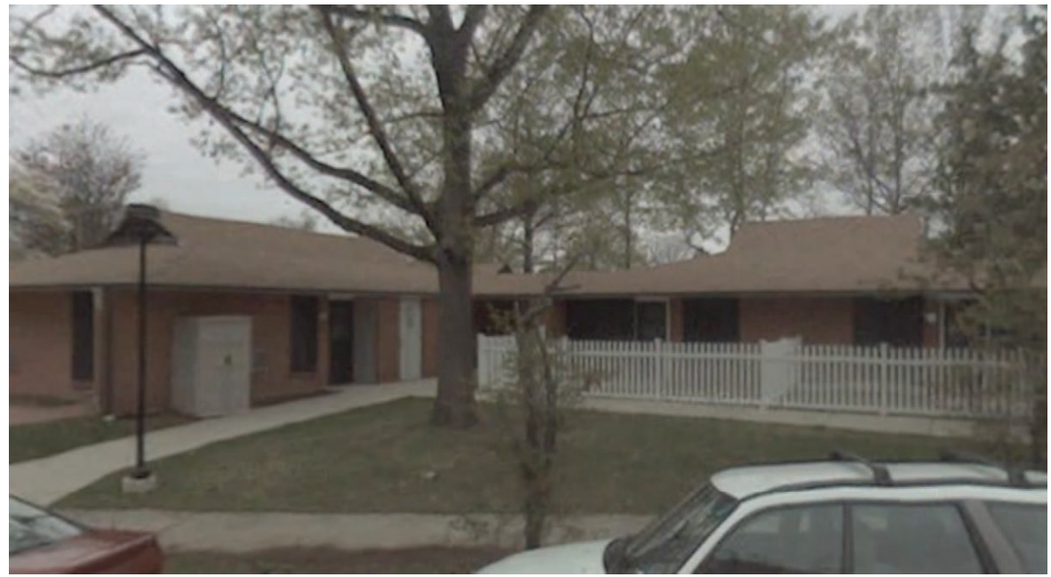
View from Goodyear, camera facing west.