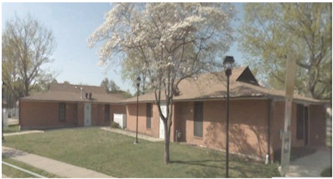
View from corner of Daisy and Goodyear, camera facing southeast.