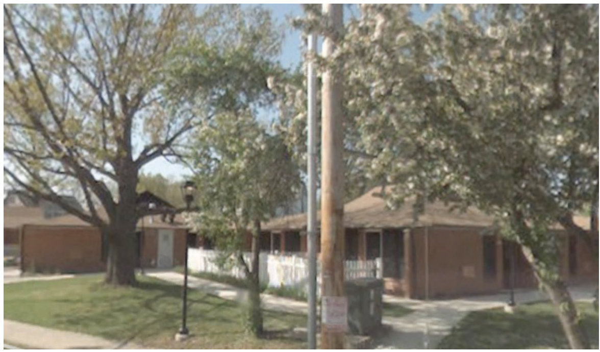
View from Goodyear, camera facing southwest.