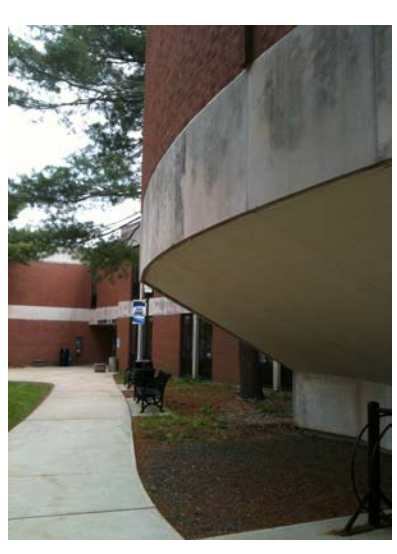
View of cantilevered lecture hall and building main entrance, camera facing east.