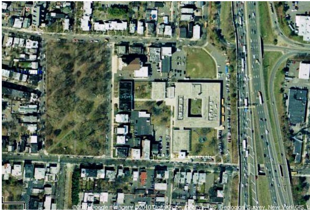
3. Aerial view from Google Maps http://maps.google.com/ accessed 2/20/2010.