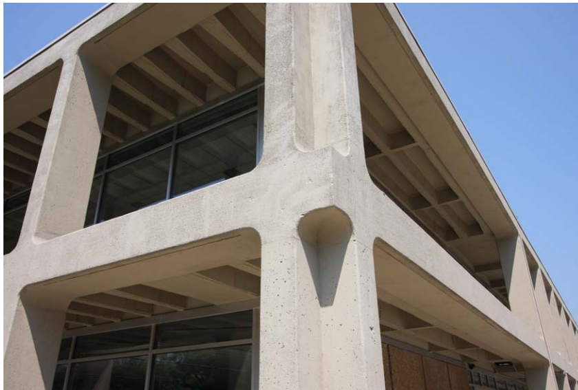
2. Southeast view from front parking, camera facing northwest.