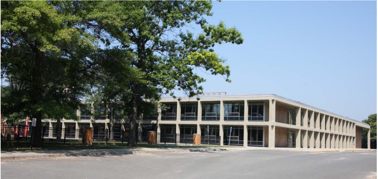
1. South view from Chapel Street, camera facing north.

Skidmore Owings & Merrill web site, Timeline of Projects, Natalie de Blois, 2005, web: http://www.som.com/content.cfm/natalie_de_blois_interview_9