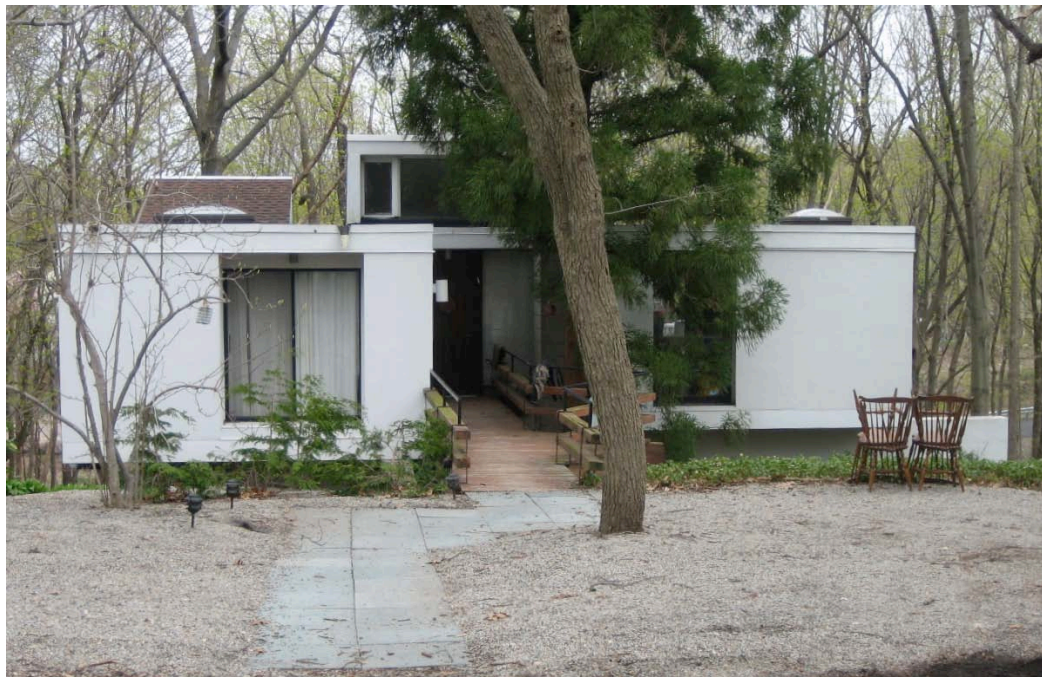
1. West view from street, camera facing east, showing front yard parking area and bridge walkway to entry.