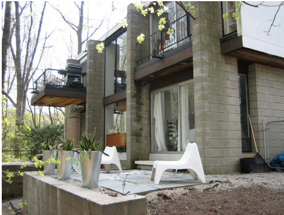
3. Northeast view, camera facing southwest, showing terraces, east elevation, and balconies.