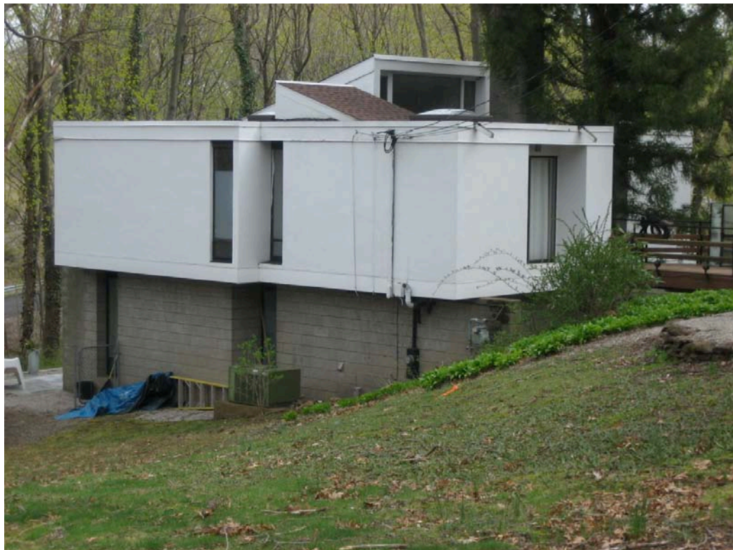
2. Northwest view from street, camera facing southeast, showing grade change and shed roofs with clerestory windows lighting the interior.