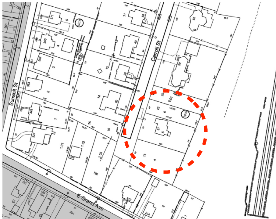
6. Site Plan – detail from City of New Haven Tax Map 096/1019/005, not to scale, North ↑