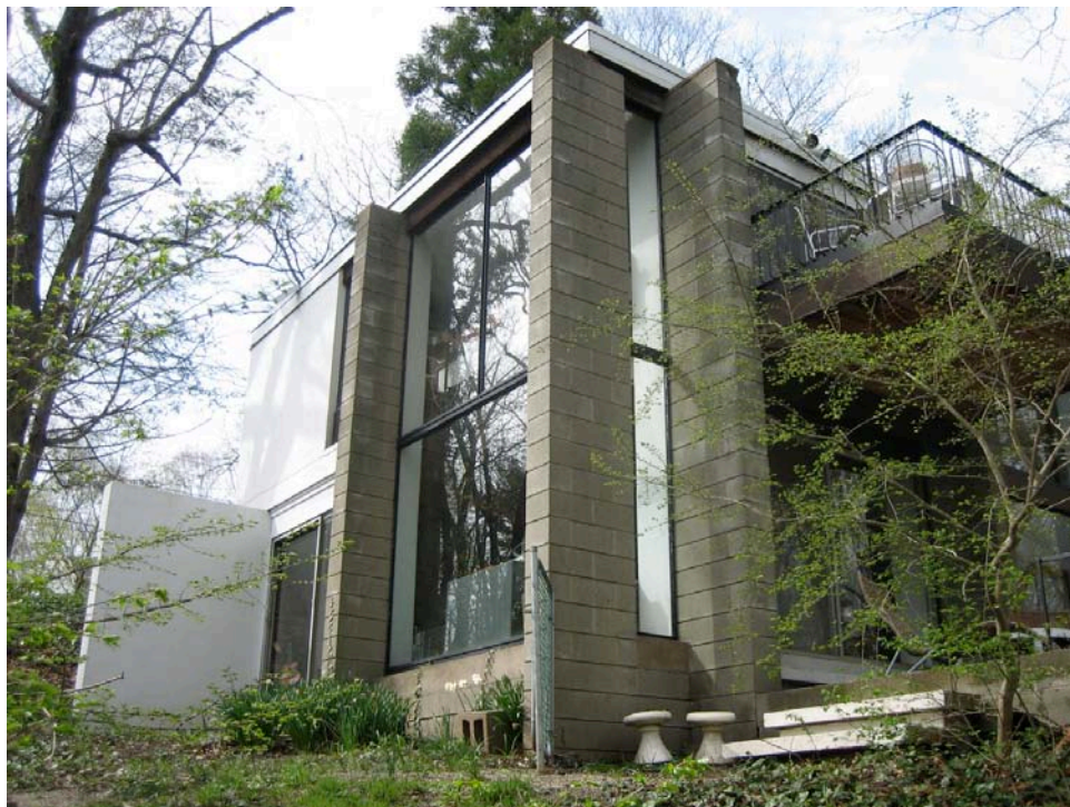
4. Southeast view, camera facing northwest, showing masonry piers, glazing, terrace, and balcony.