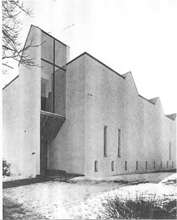
1. Northwest view from Webster Street, camera facing southeast.