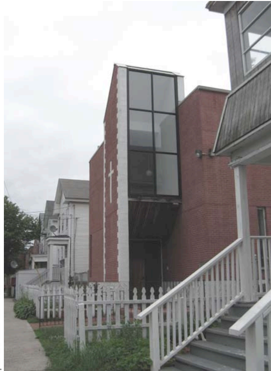
2. Northwest view from Webster Street, camera facing southeast, showing altered glazing above entrance.