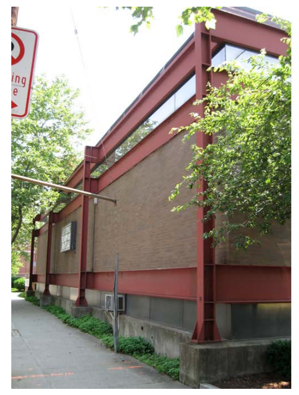
4. West view - street facade.

3. Google Map Street View — neighborhood context <a href="http://maps.google.com/">http://maps.google.com/</a> accessed 7/01/2010.