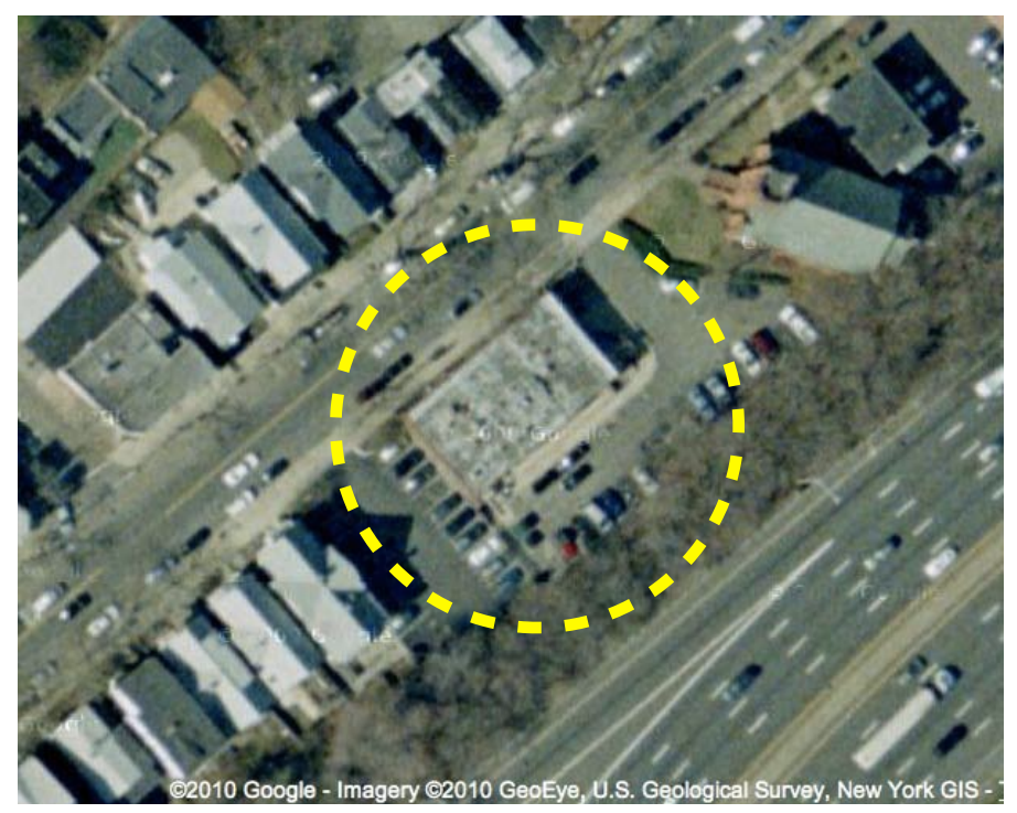
7. Aerial view from Google Maps: <a href="http://maps.google.com/">http://maps.google.com/</a> accessed 7/01/2010.

6. Site plan detail - City of New Haven Tax Assessors Map Map/Block/Parcel 211/0595/00100.