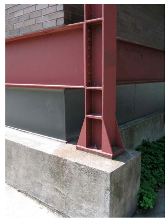
5. Corner detail of structural steel.