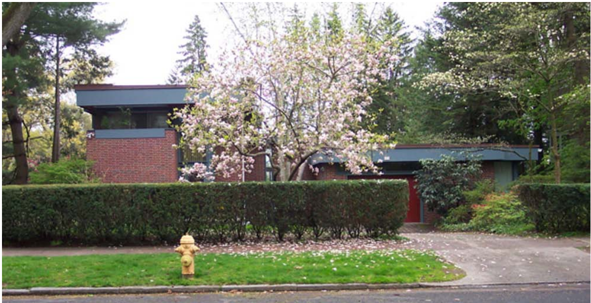
1. West view from Saint Ronan Street, camera facing east.