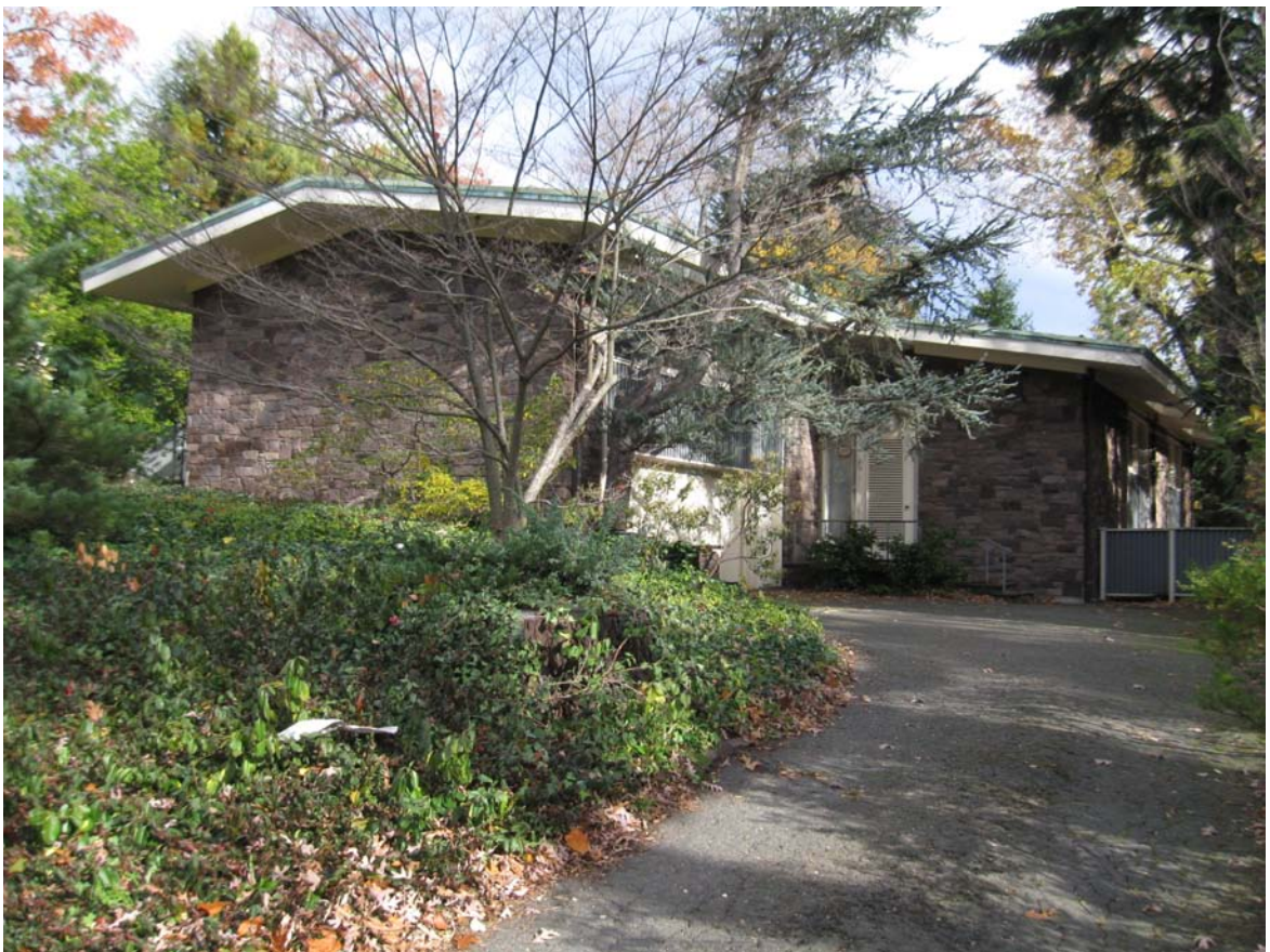
2. Southwest view from Saint Ronan Street, camera facing northwest.