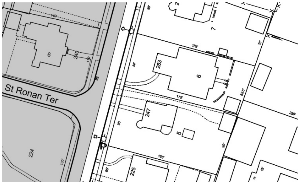
5. Site Plan – detail of City of New Haven Tax Map 220/410/006; not to scale, North ↑