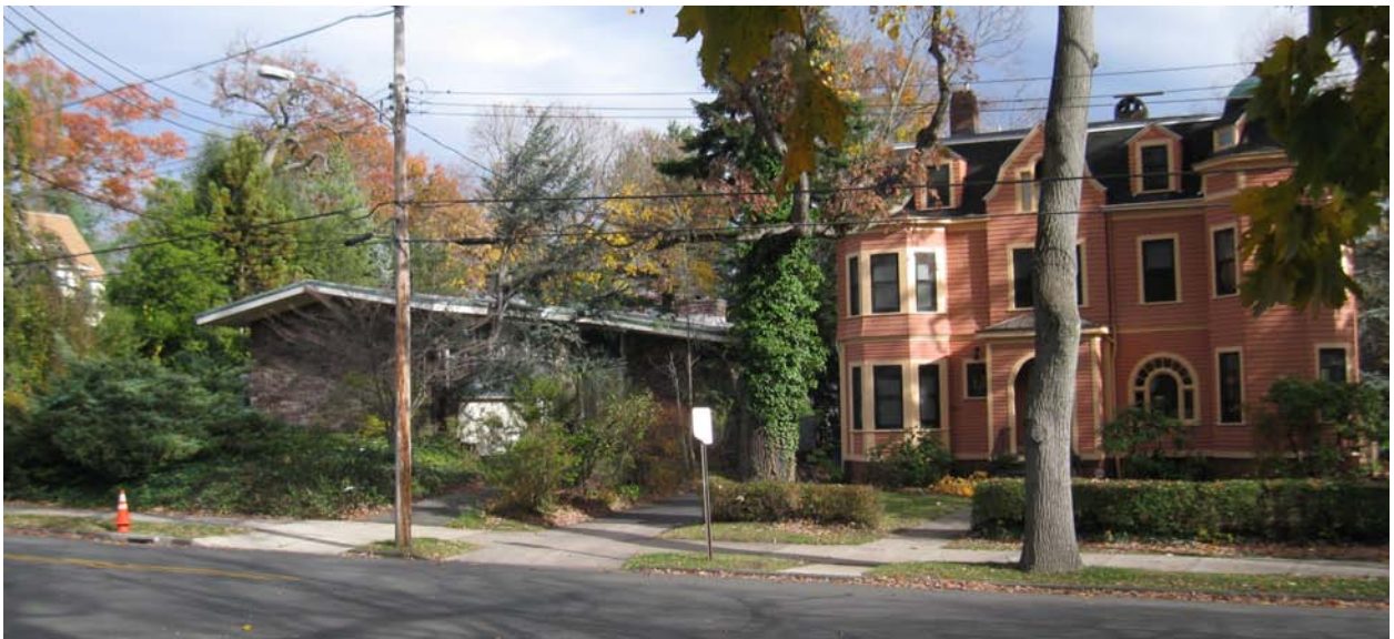
1. West view from Saint Ronan Street, camera facing west, showing scale contrasting with older houses.