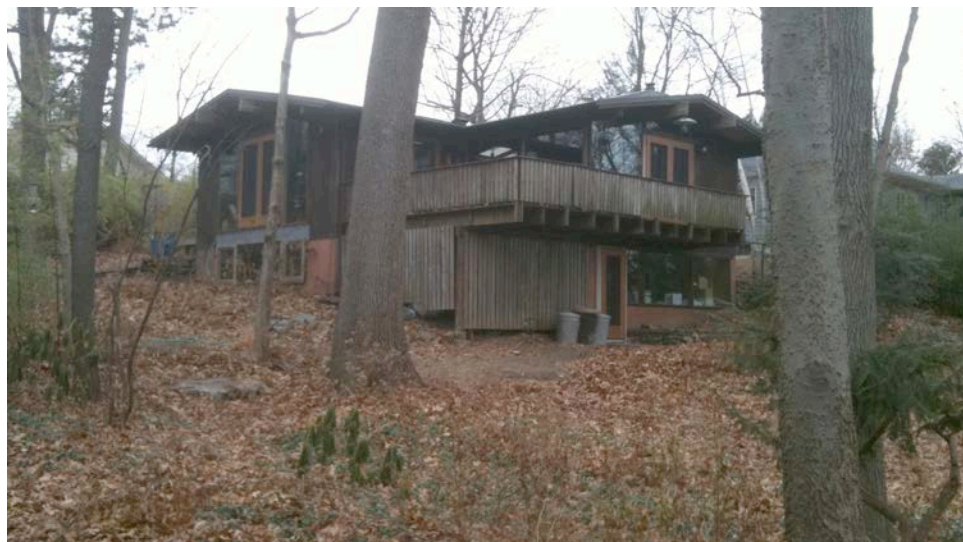
2. Southeast view from Reservoir Street, camera facing northwest.