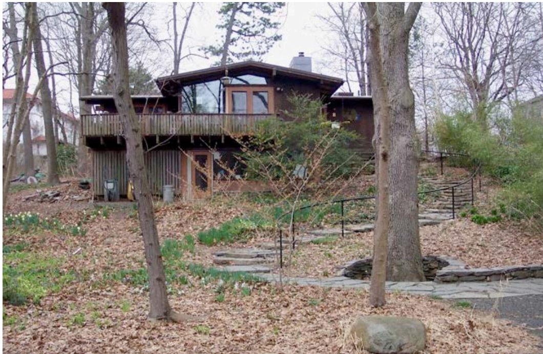
1. East view from Reservoir Street, camera facing west.

Walker Lithograph & Publishing Co., Atlas of New Haven Connecticut 1911 , http://www.wardmaps.com/viewasset.php?aid=73