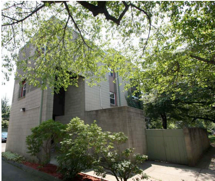
1. Northwest view from street, camera facing southeast.