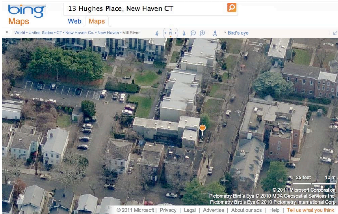
3. North aerial view from Bing Maps http://www.bing.com/maps/ accessed 6/12/2011.