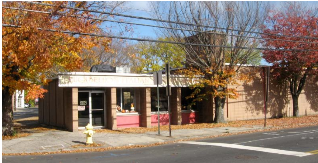
1. South (front) and west (side) elevations from Grand Avenue, camera facing northeast.