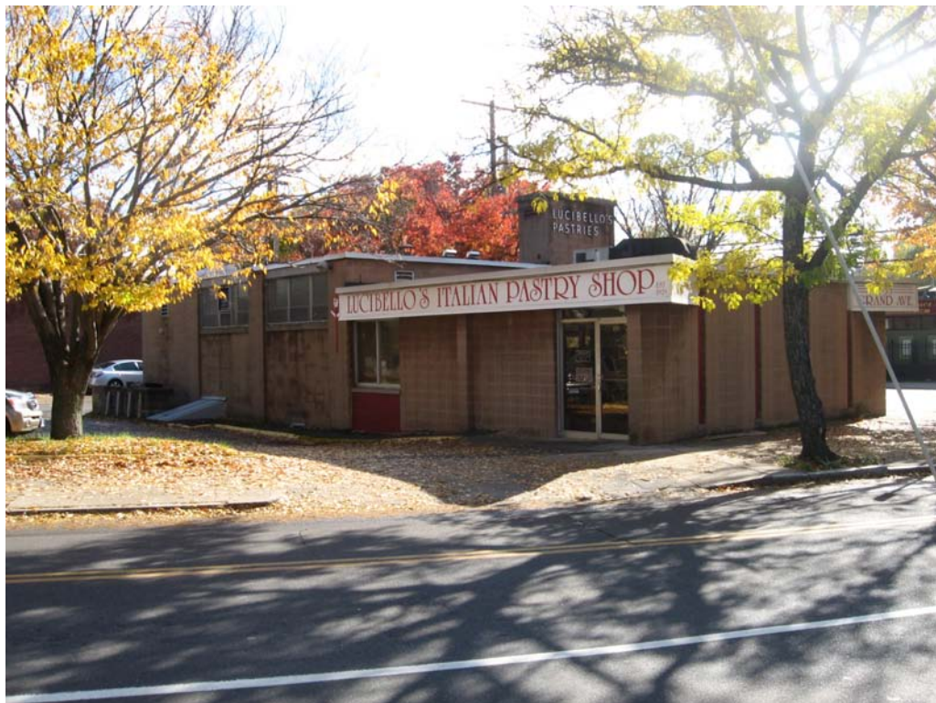
2. North (rear) and west (side) elevations from Olive Street, camera facing southeast.