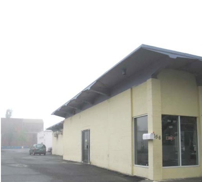
2. East side view, camera facing south.