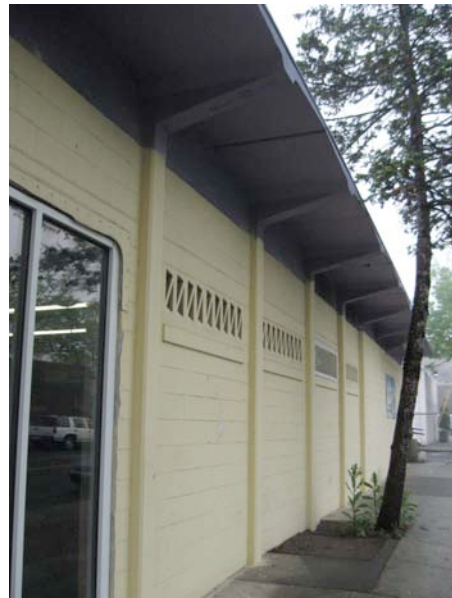
3. West side, camera facing south.