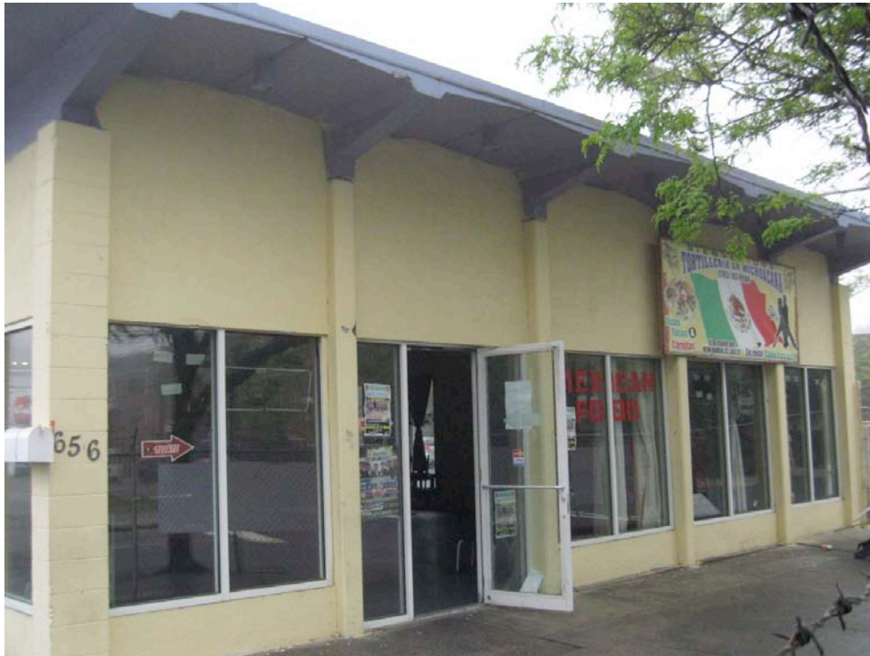
1. North (front) view, camera facing southwest.