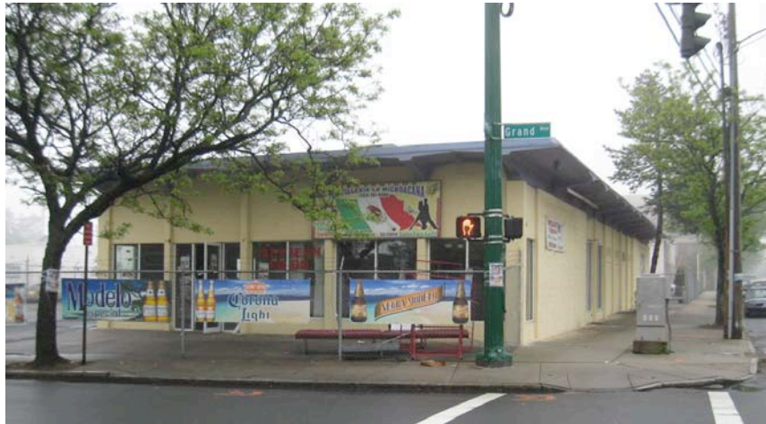
4. Northwest view, camera facing south.