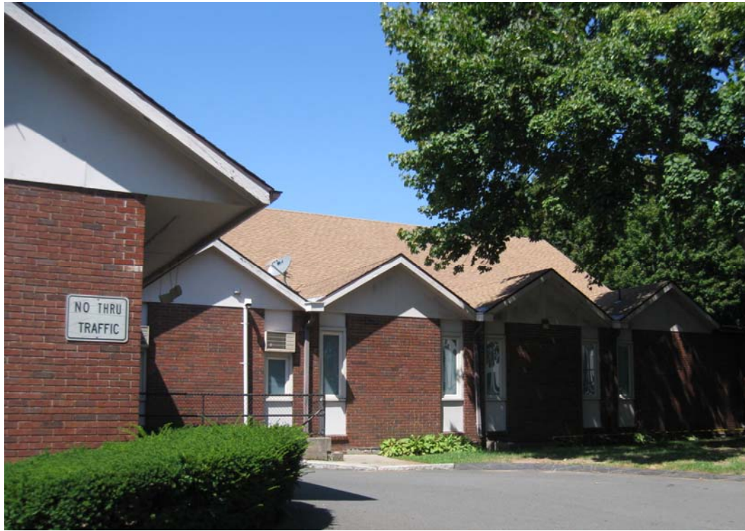
3. East view from parking area, camera facing west.