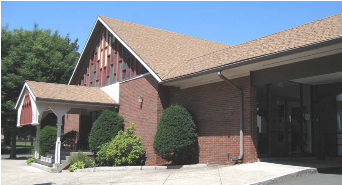
2. Southeast view from parking, camera facing northwest.