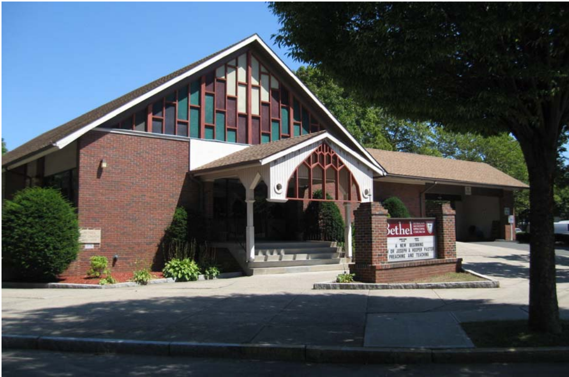
1. South view from Goffe Street, camera facing north.