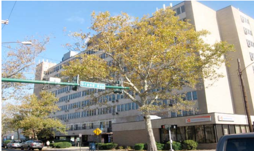
1. Southwest view from Grand Avenue and Ferry Street, camera facing northeast.