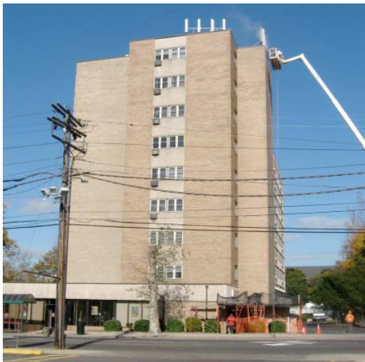
2. South view, camera facing north.