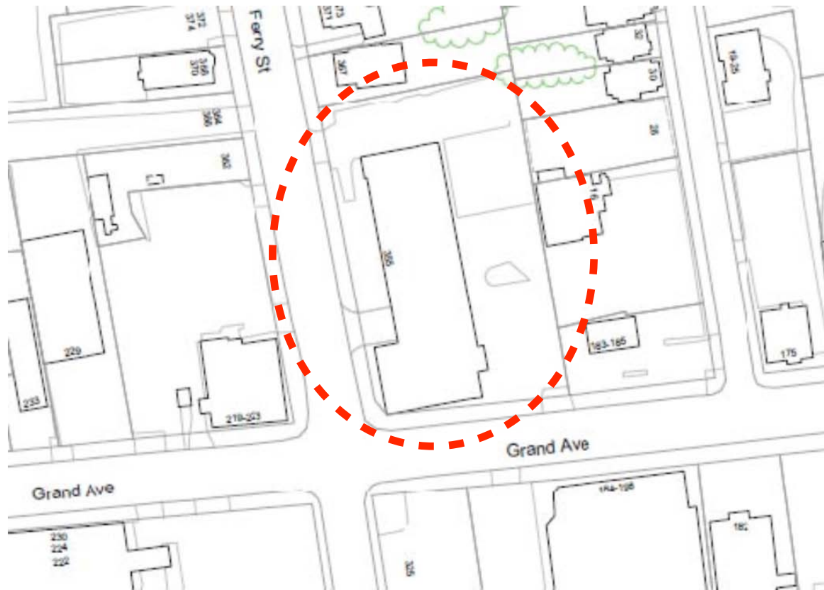
7. Site Plan – detail from City of New Haven Tax Map 167/0758/022 not to scale, North ↑.