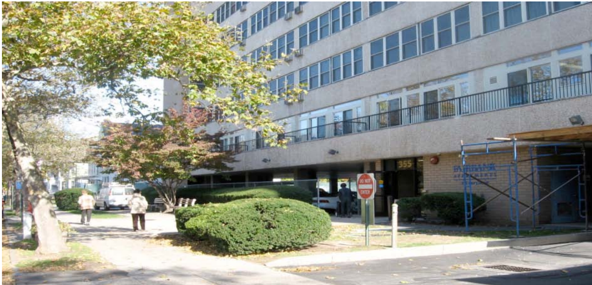
5. West view of street level, camera facing northeast.