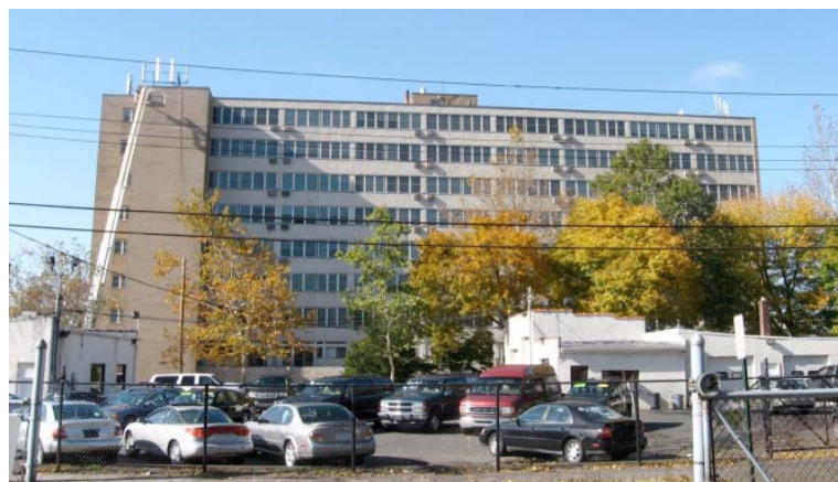
4. East view from Bright Street, camera facing west.