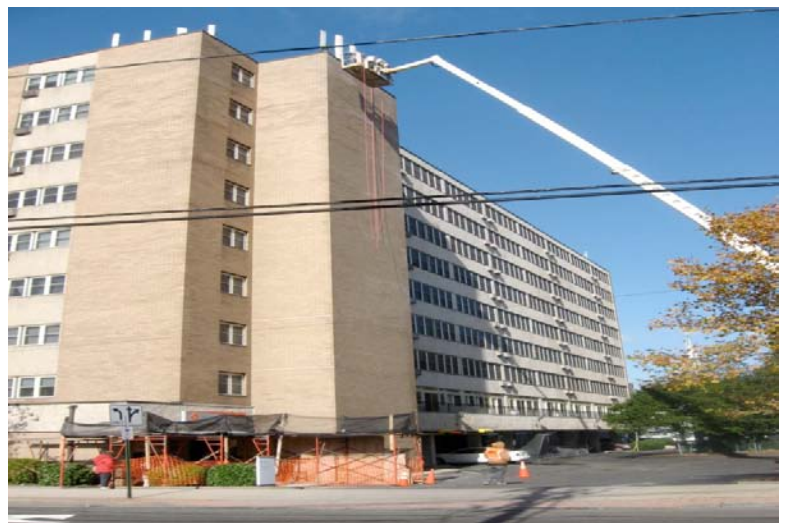
3. Southeast view, camera facing northwest.