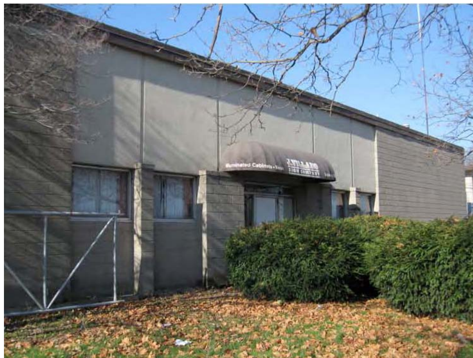
2. East view from East Street, camera facing northwest.