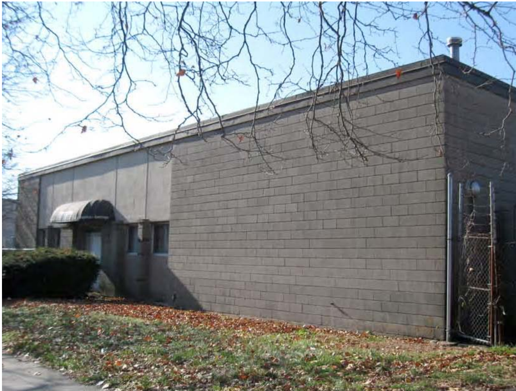
1. East view from East Street, camera facing southwest.