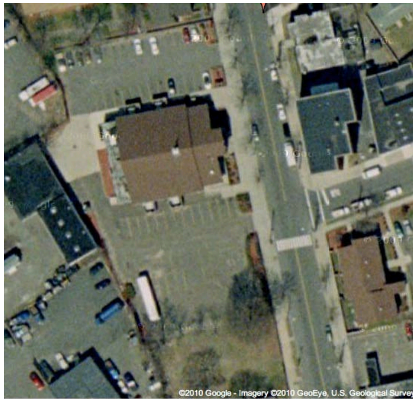
4. Aerial view from Google Maps http://maps.google.com/ accessed 8/05/2010.