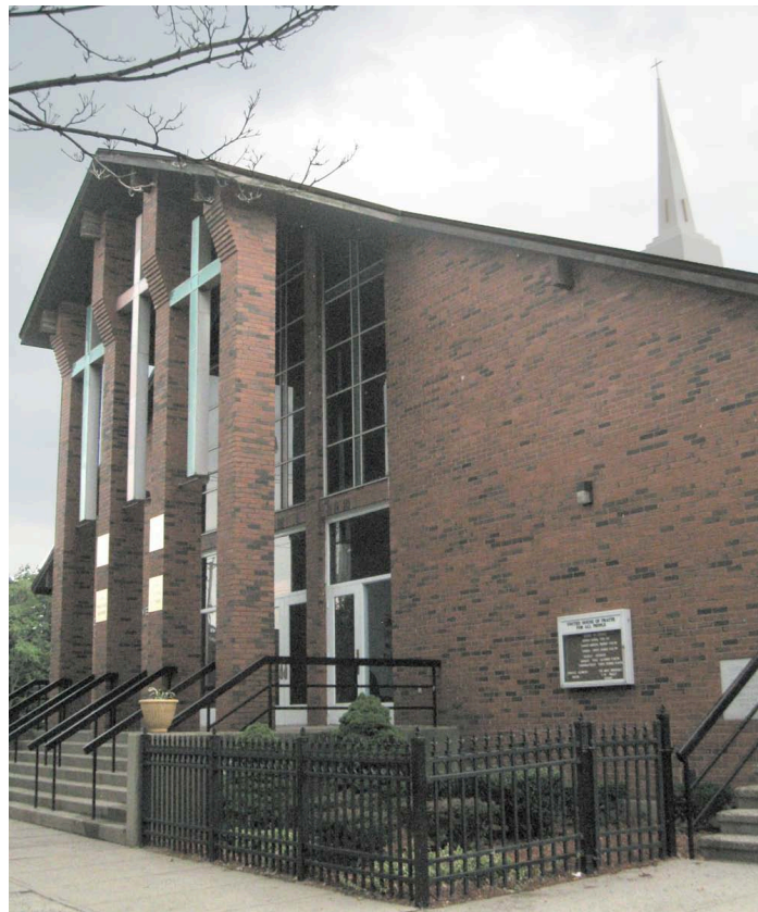
2. Northeast view of facade from Dixwell Avenue, camera facing southwest.