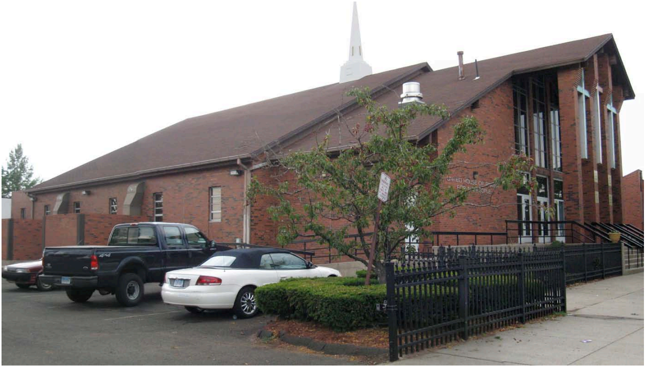
1. Southeast view from Dixwell Avenue, camera facing northwest.