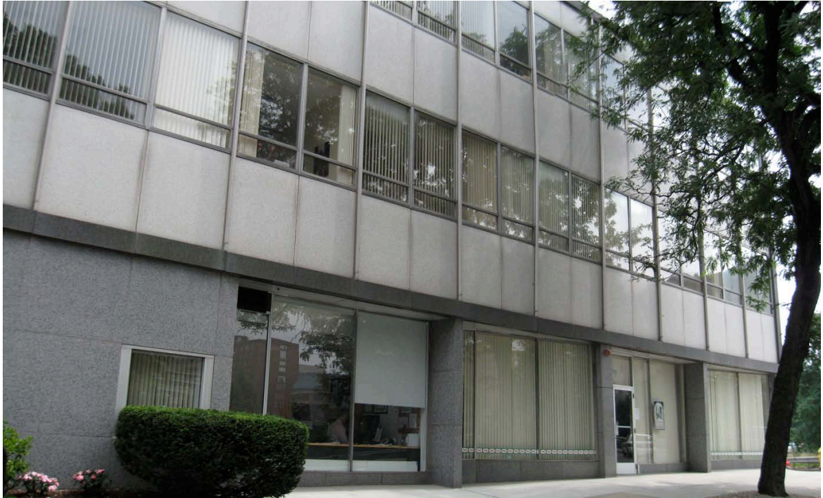
1. West view from College Street, camera facing southeast.