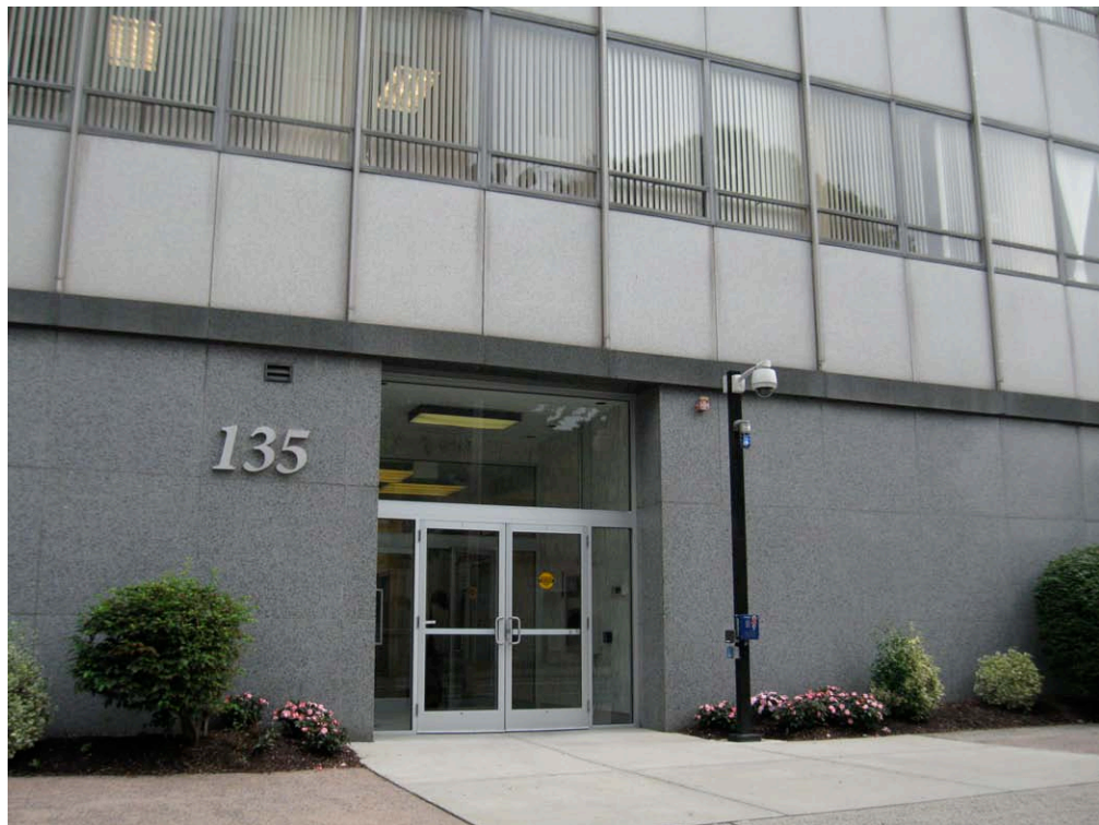
2. West view of office entrance, camera facing east.