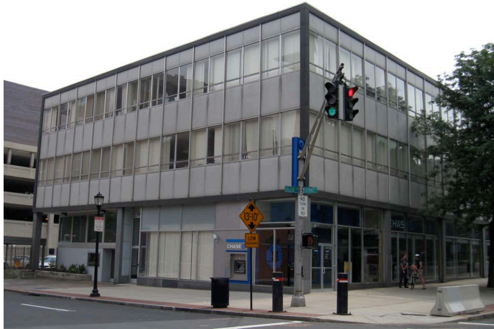
3. Northwest view from College and George Streets, camera facing south.