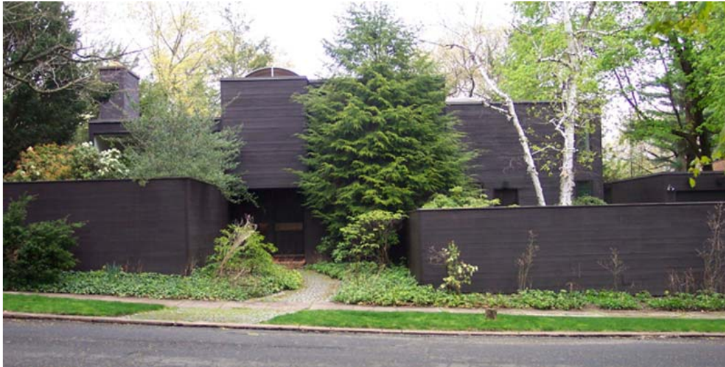
1. S view from Cliff Street, camera facing north.