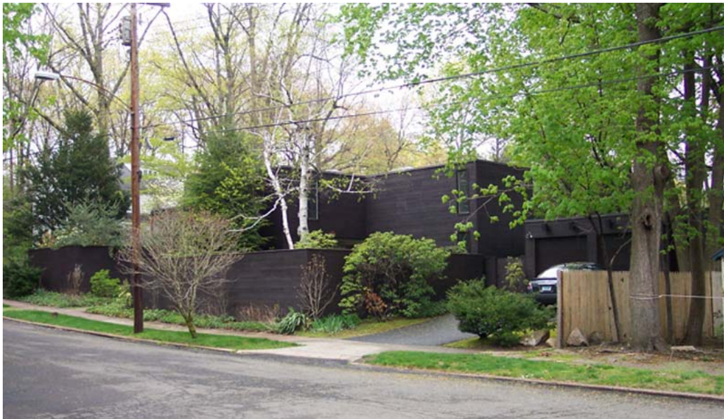
2. SE view from Cliff Street, camera facing northwest