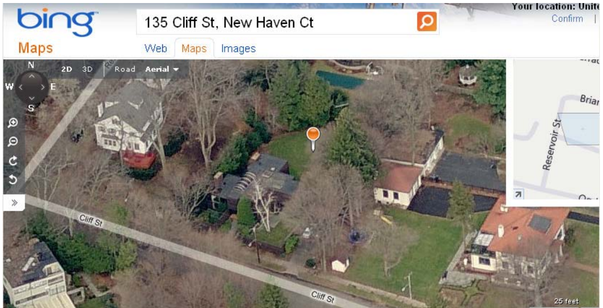
3. View - neighborhood context – Bing Maps http://www.bing.com/maps/ accessed 9/30/2010.