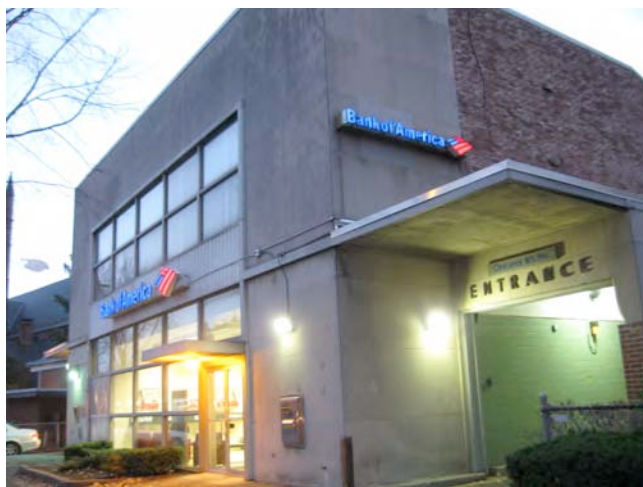
2. N view from Broadway, camera facing east.