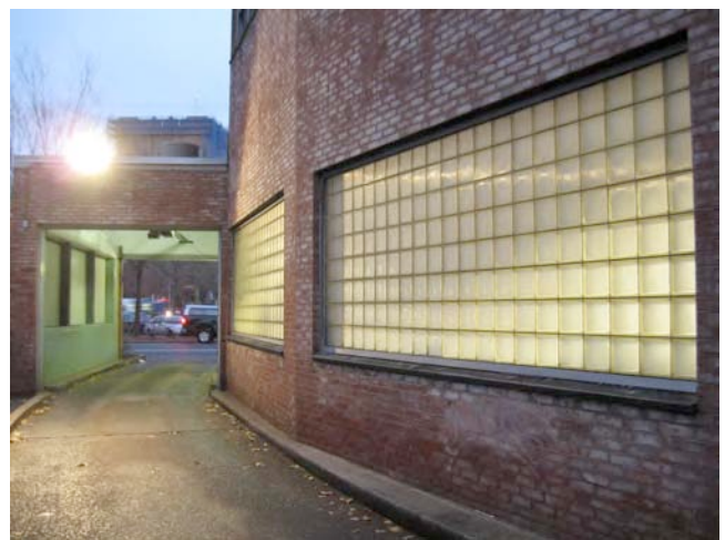
3. Southwest view from rear, camera facing north.