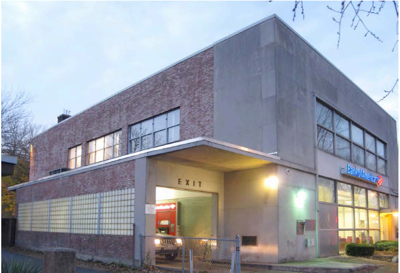
1. N view from Broadway, camera facing south.