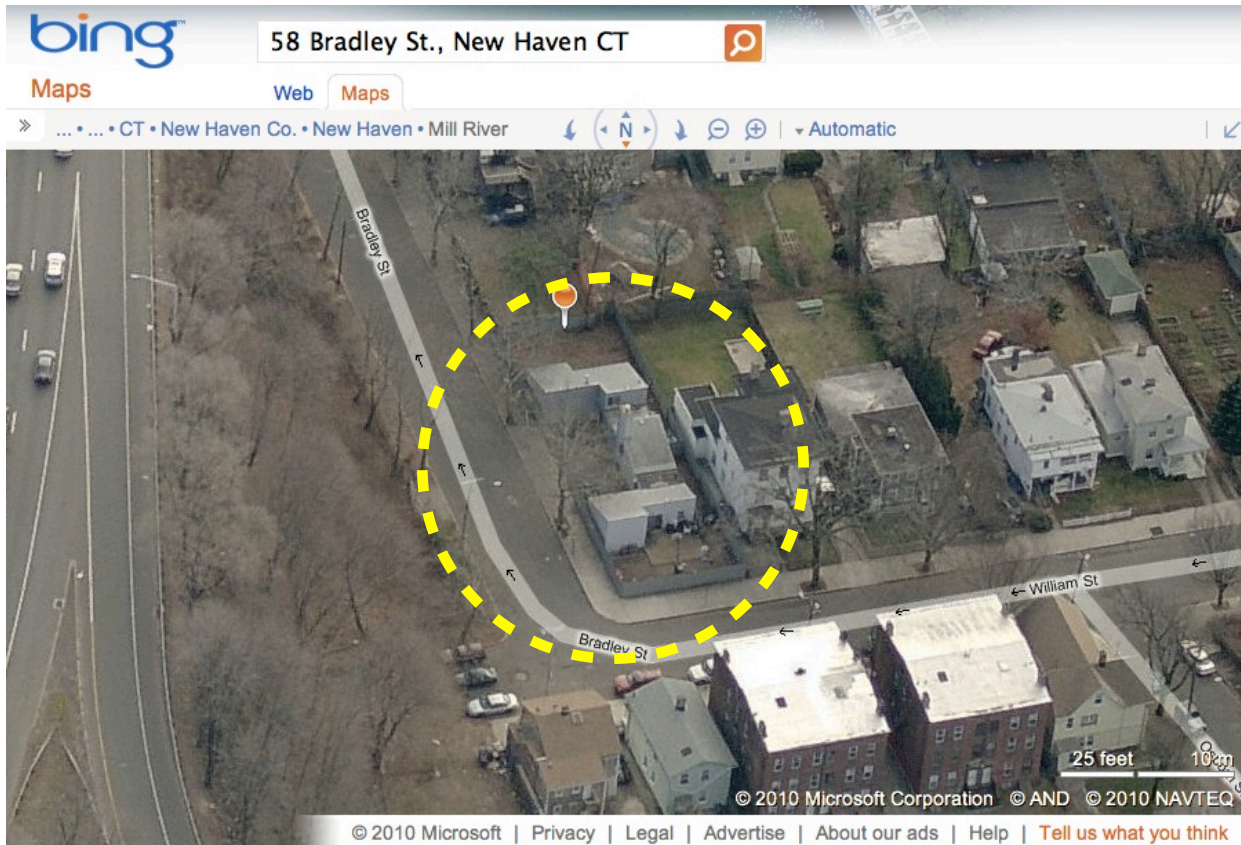
4. South aerial view from Bing Maps http://www.bing.com/maps/ accessed 12/10/2010.