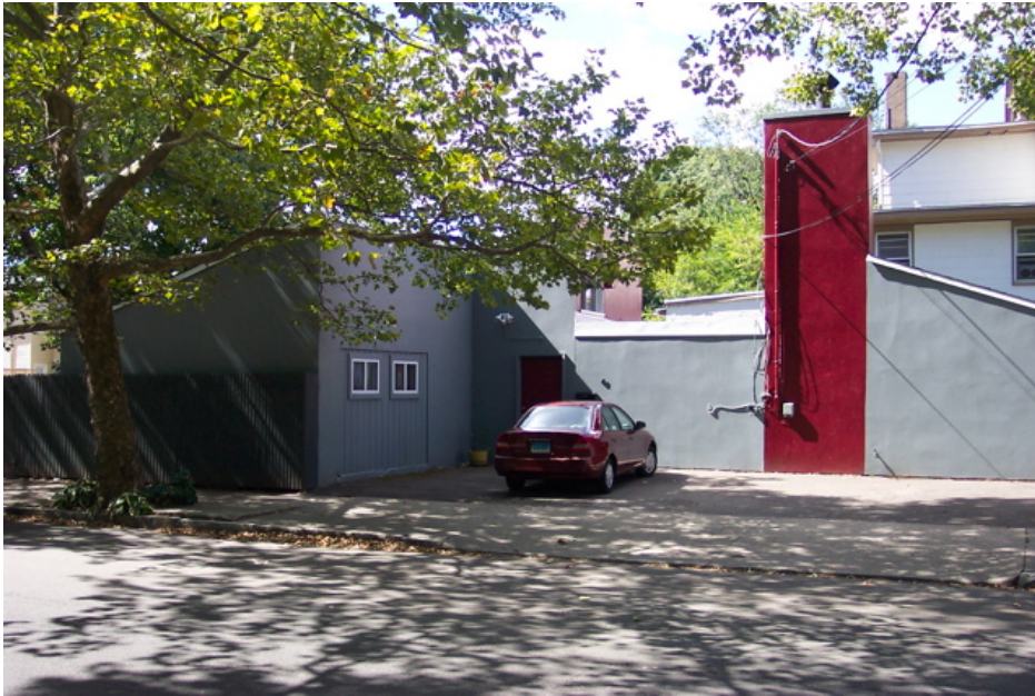
1. East view from Bradley Street, camera facing west.

Walker Lithograph & Publishing Co., Atlas of New Haven Connecticut 1911 , http://www.wardmaps.com/viewasset.php?aid=73