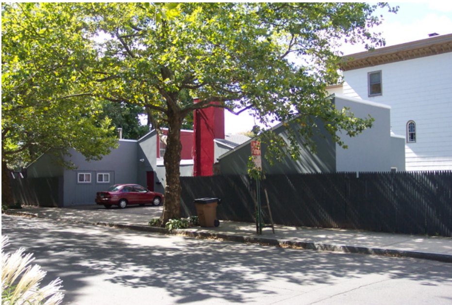
2. Northeast view from Bradley Street, camera facing southwest.