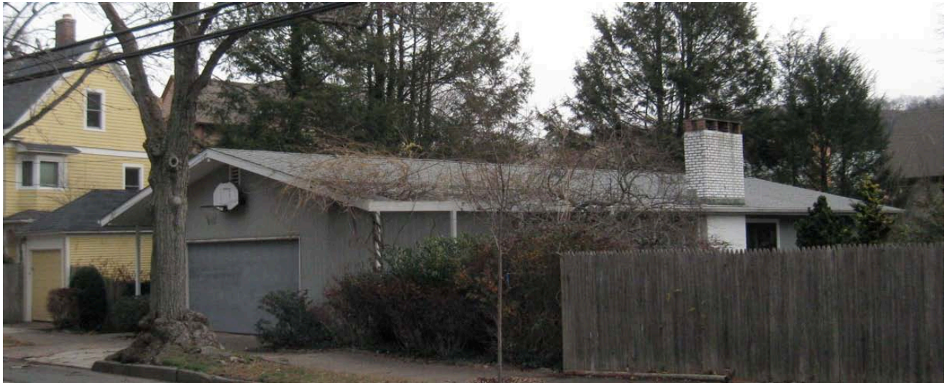
1. Southwest view from Autumn Street, camera facing northeast, showing roof cut-out areas and chimney.