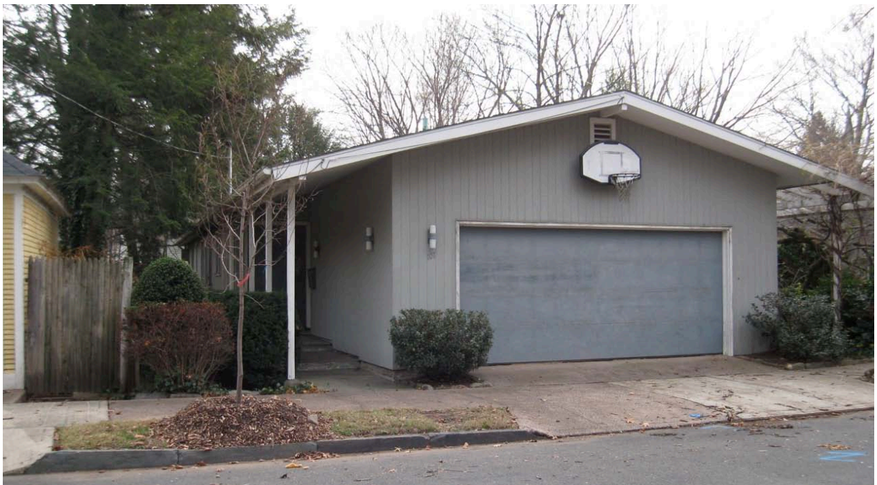
2. Northwest view from Autumn Street, camera facing southeast, showing entry porch.