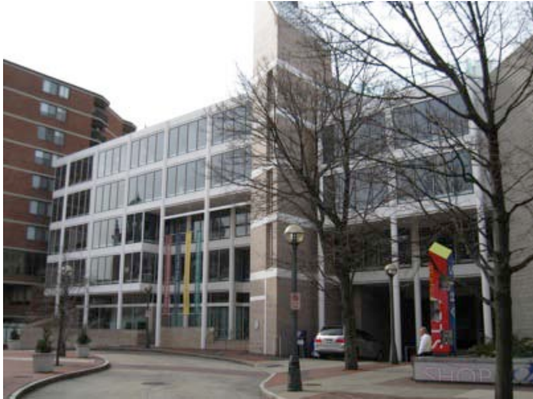
1. Northwest view of Audubon Street façade, camera facing southeast.