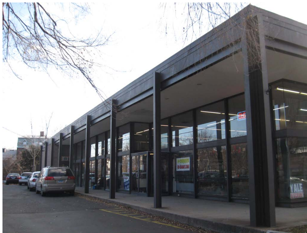
3. Northeast view, camera facing southwest.