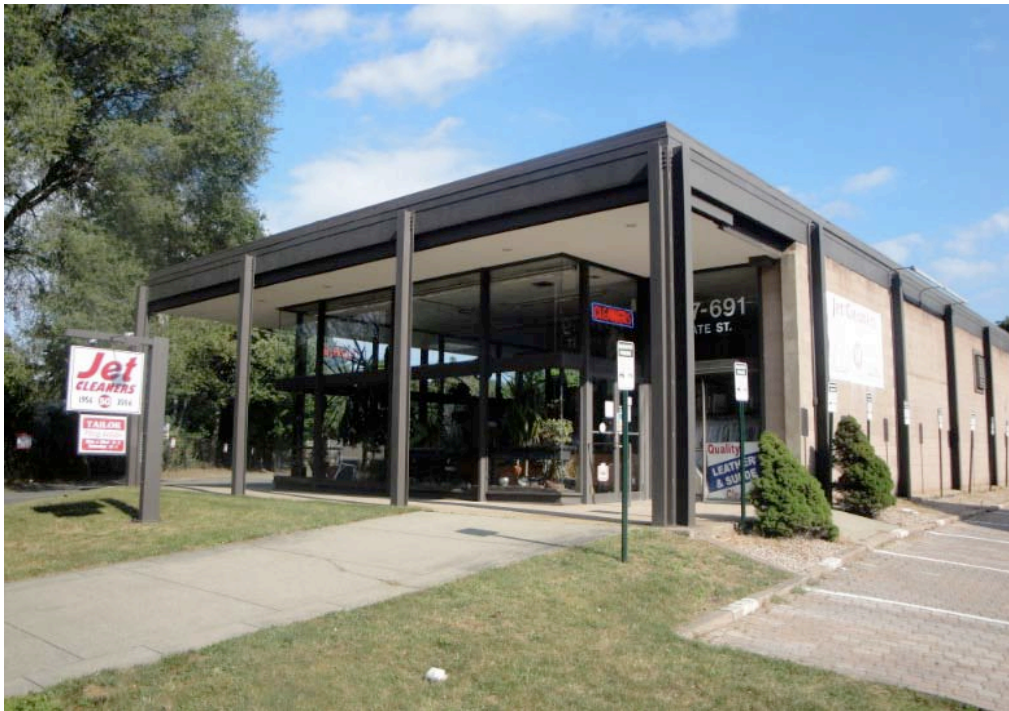
2. West view from State Street, camera facing east.