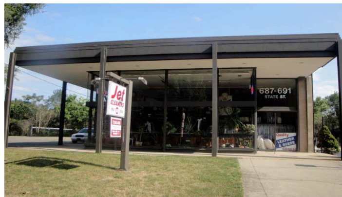
1. Northwest view from State Street, camera facing southeast.

Pannenberg, Frank, personal communication, 2011.