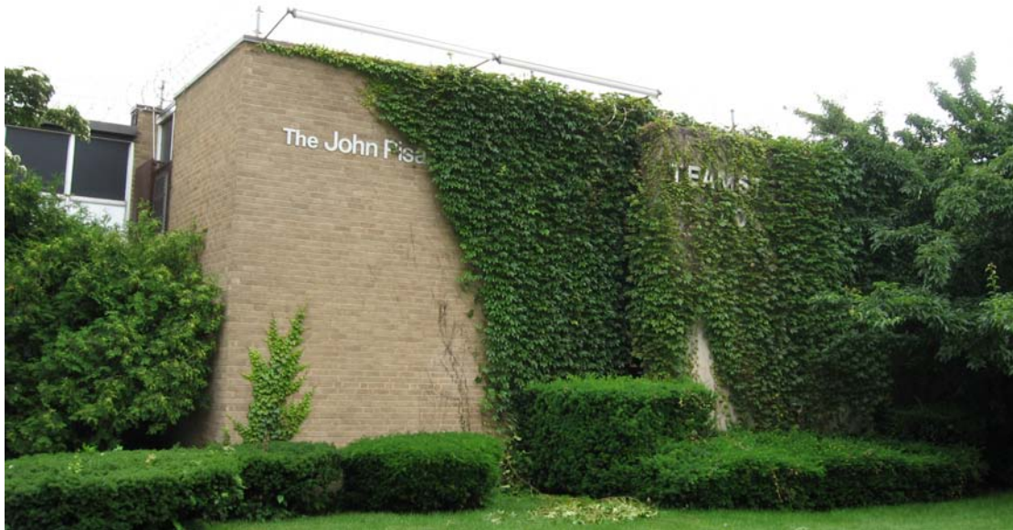
1. East elevation from Wallace Street, camera facing northwest.