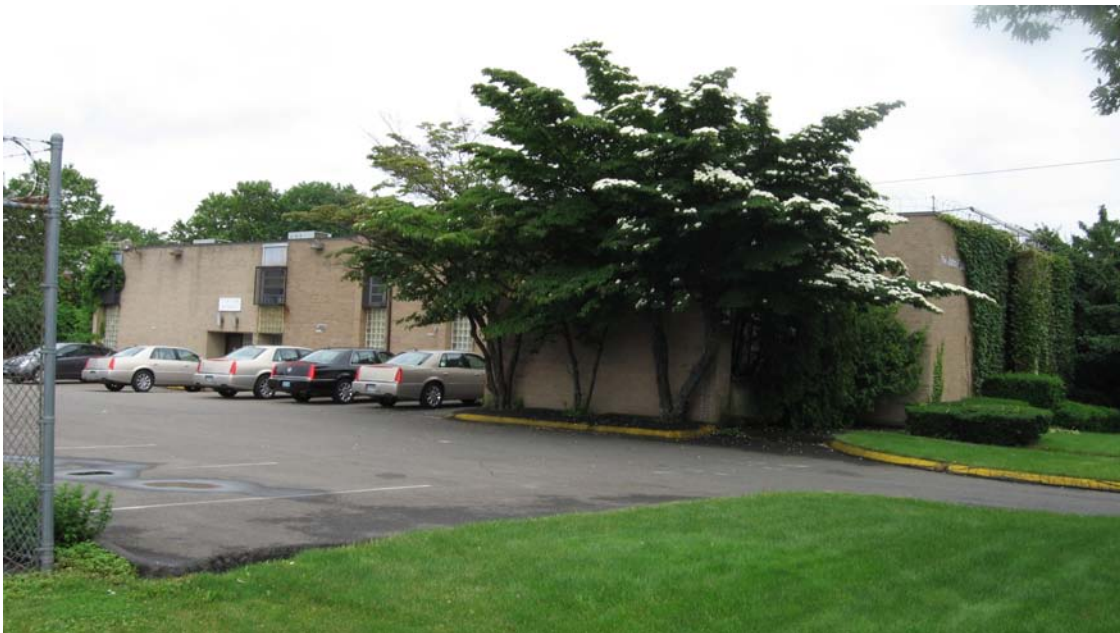
2. South and east elevations from Wallace Street, camera facing northwest.