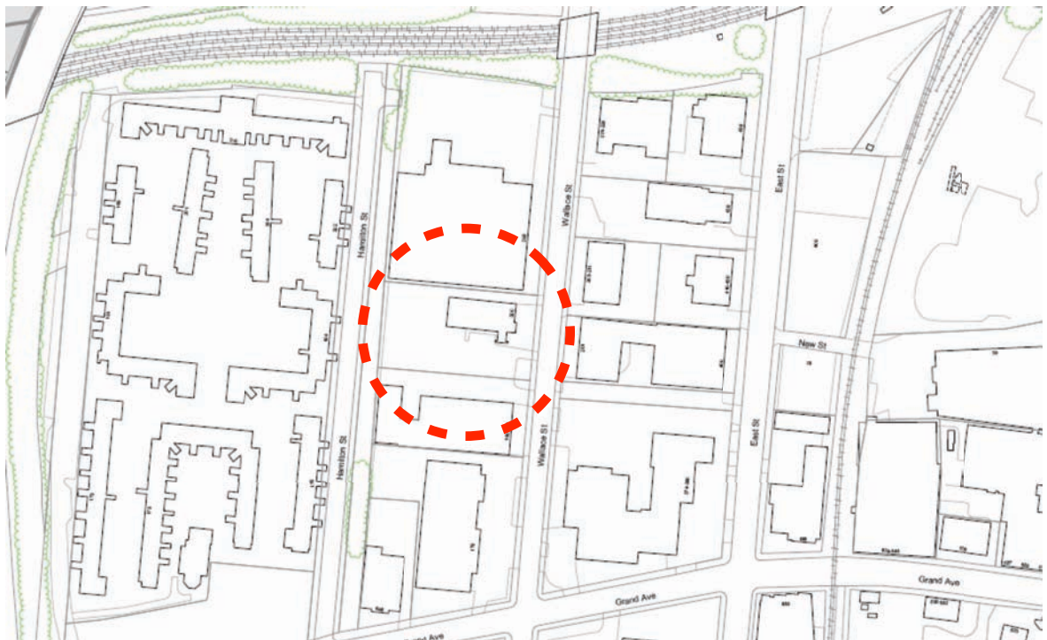
6. Site plan – from City of New Haven tax map, parcel 200/0587/002, not to scale, North ↑.