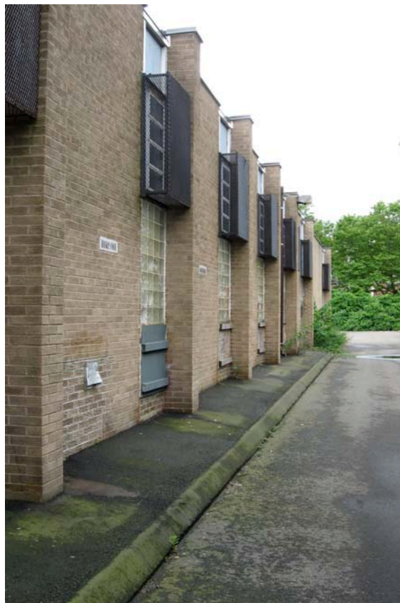
4. Detail of window features, north elevation, camera facing west.