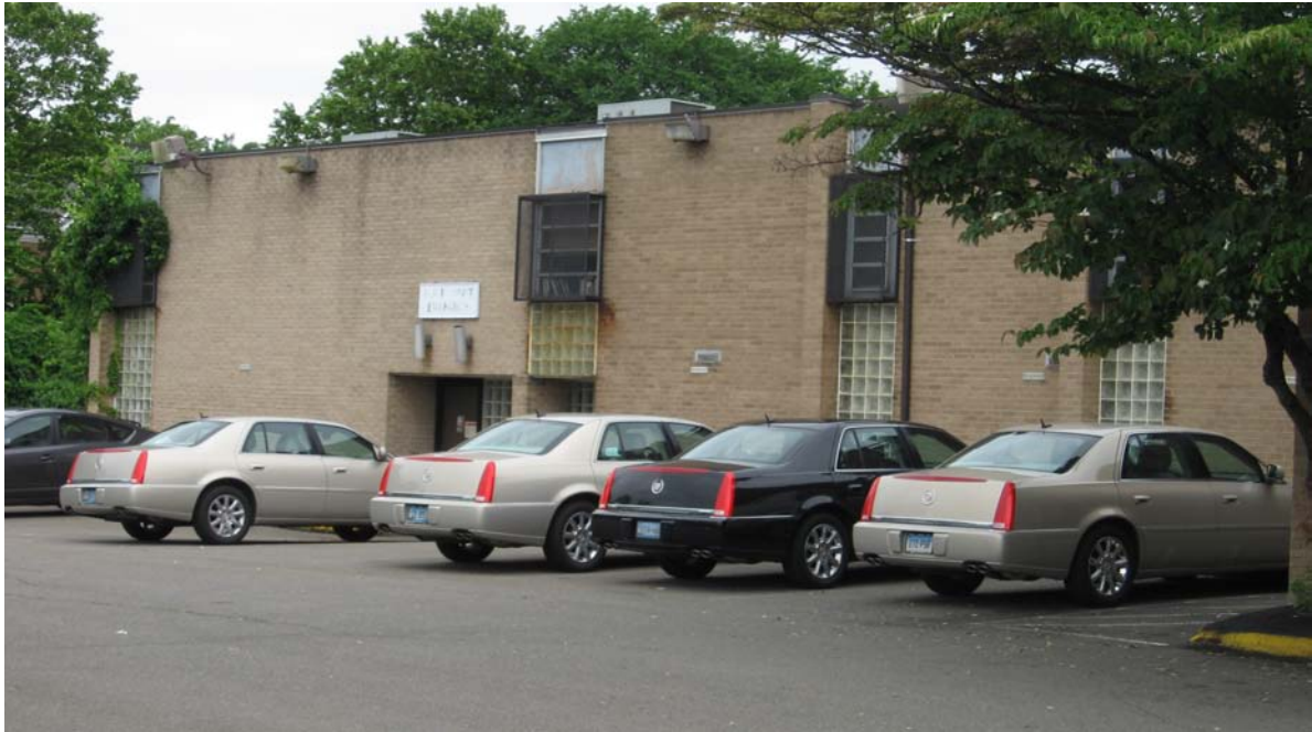
3. South (side) elevation from Wallace Street, camera facing northwest.