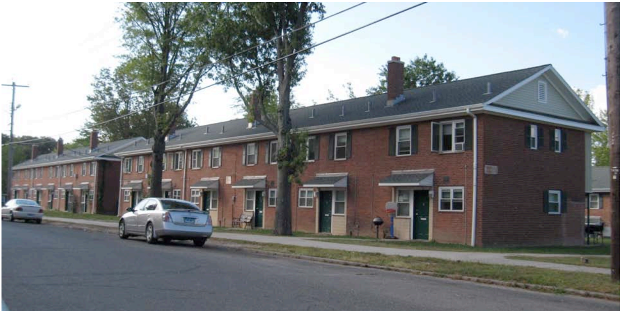
2. East view of South Genesee Street, camera facing southwest, buildings after renovation.