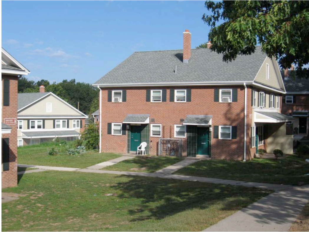
1. Southeast view from Valley Street parking lot, camera facing northwest, buildings after renovation.