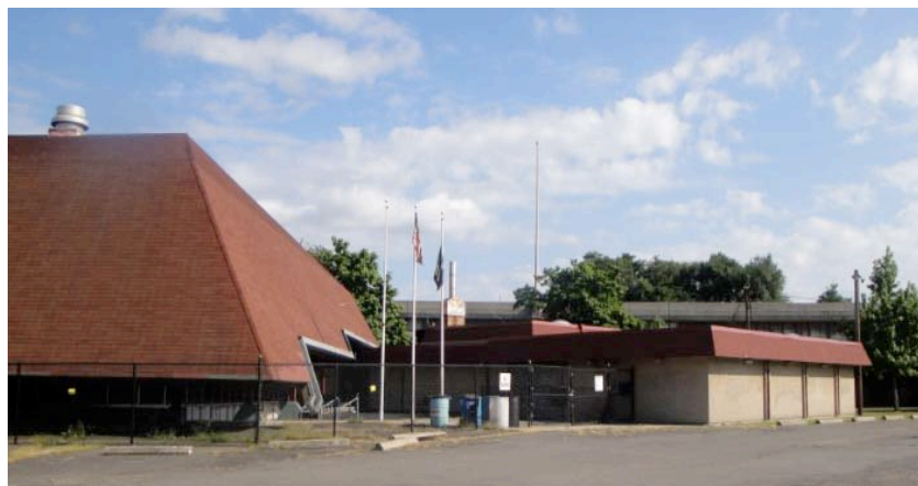
3. West view from parking area, showing southwest side of rink roof structure and west side of warming house, camera facing east.