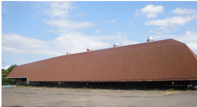
1. View from parking area, northwest view of rink roof, camera facing northeast.