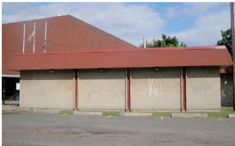
2. South view of club/warming house from State Street entrance, camera facing north.