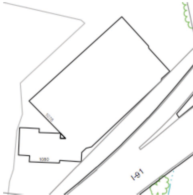
4. Site Plan — detail from City of New Haven tax Assessor's Map 182/0420/0080.