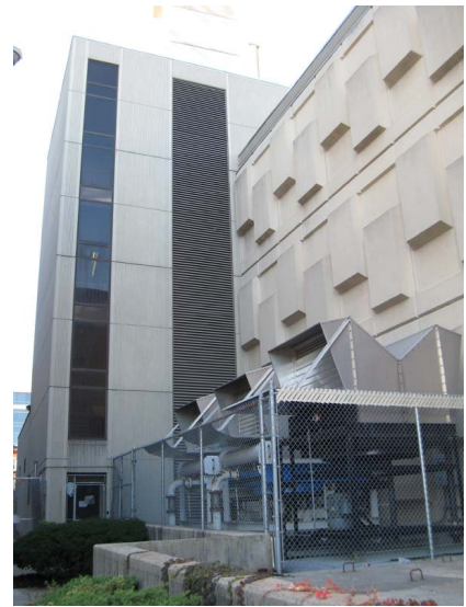
4. South side abutting tunnel, camera facing northwest.