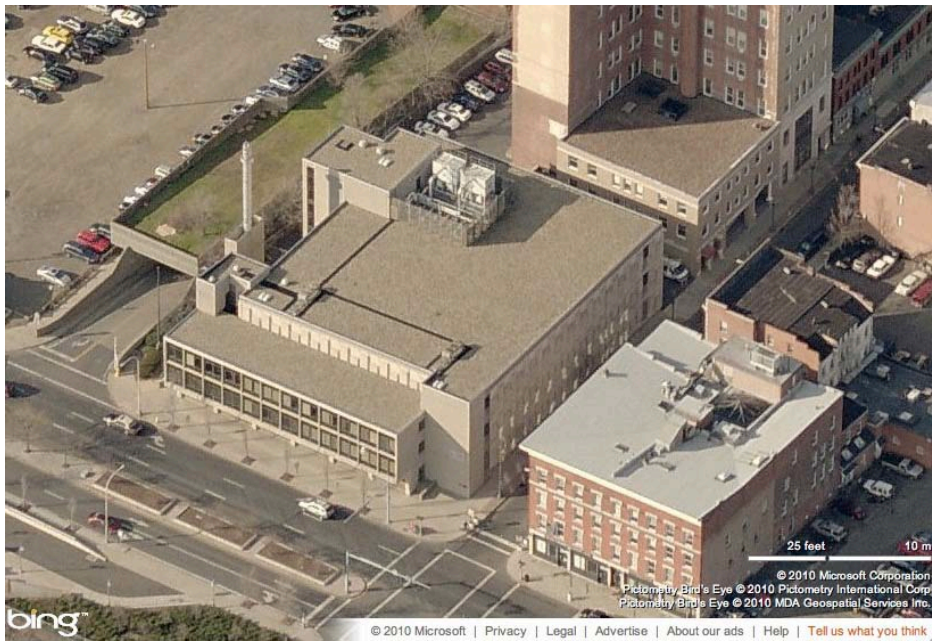
6. Northeast aerial view facing southwest, from Bing Maps: http://www.bing.com/maps accessed 7/12/2010.