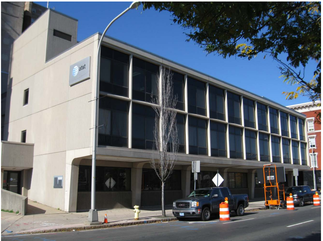
1. East view from State Street, camera facing northwest.

The primary façade of this building faces east toward State Street and consists of a 3-story precast concrete frame with glazed infill. The 1st floor is recessed so that the upper floors, cantilevered over the sidewalk, form a covered walkway at street level. All floors appear to be used as office spaces, with windows facing the street but no prominent entrances or commercial activity. An understated building entry is located at the building's south end. Along the Court Street (north) façade, the wall is composed of large textured pre-cast concrete modules arranged in a pattern that appears intended to create a sculptural effect on a blank windowless wall. A taller block at the southwest corner includes a free-standing chimney and has a ribbed concrete finish and strip glazing panels in dark tinted glass. Except for the offices facing State Street, the building appears to contain telecommunications equipment, its bulk somewhat disguised by the band of glazed spaces facing State Street.