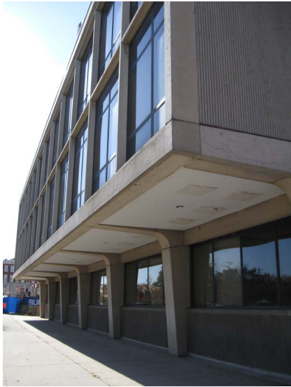
2. Northeast view, camera facing south.