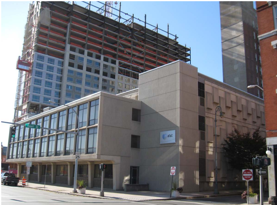
5. Northeast view, camera facing south, from corner of State and Court Streets.