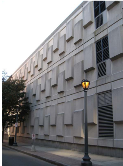
3. North wall facing Court Street, camera facing southeast.