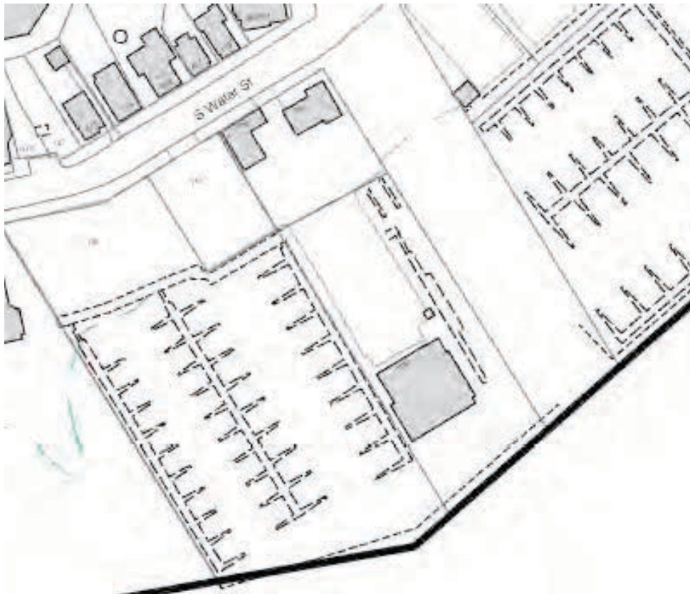
5. Site Plan – detail from City of New Haven Tax Map 232/002/0203, not to scale, North ↑.