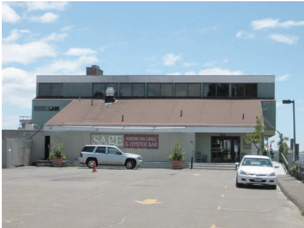
1. North (front) elevation from South Water Street, camera facing south.