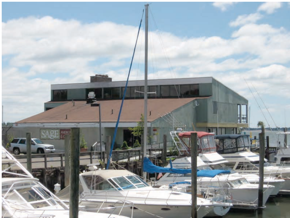
2. Northeast view from entrance drive, camera facing southwest.