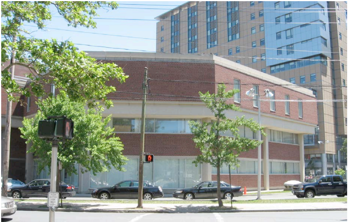
2. Southwest (rear) elevation from Howard Avenue, camera facing northeast.