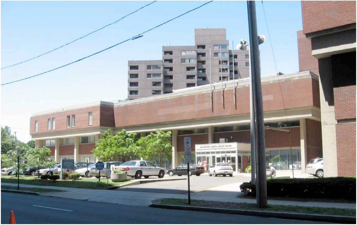
1. East (front) elevation from Park Street, camera facing southwest.