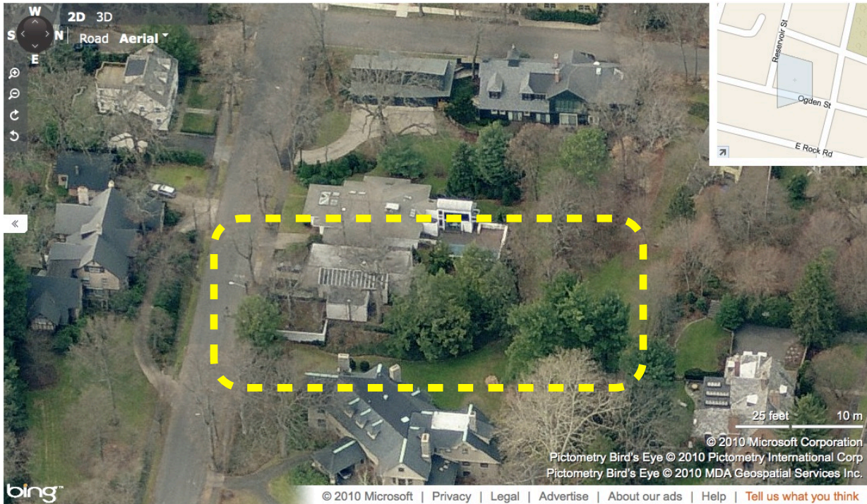
3. East aerial view, from Bing Maps http://www.bing.com/maps/ , accessed 5/20/2010.