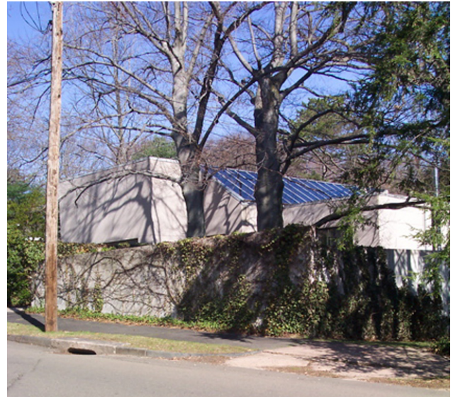
2. Southeast view from Ogden Street, camera facing northwest.