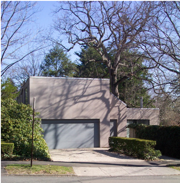
1. South view from Ogden Street, camera facing north.