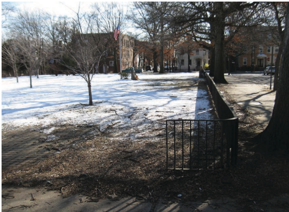
1 View from Jefferson Street across the street