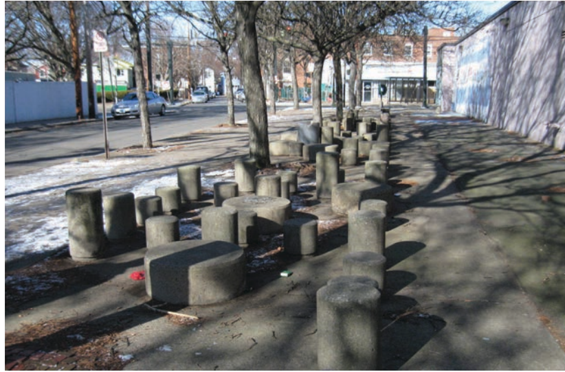
2 View of m Jeffe s tre s dewak me af ac g n th