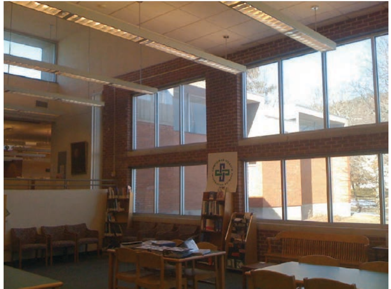
4. Interior of adult reading room, camera facing east.