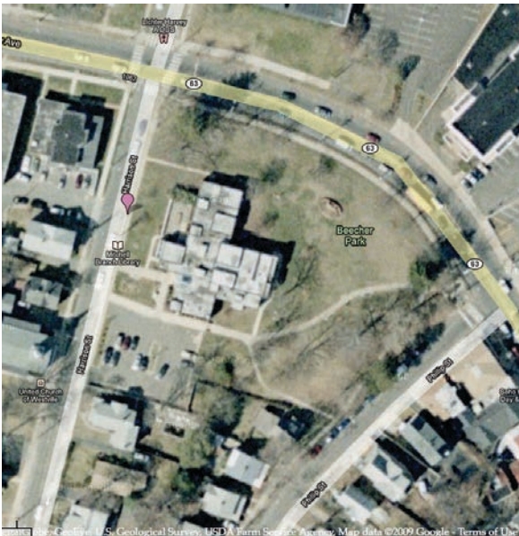
5. West aerial view