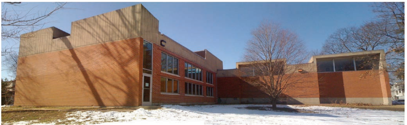
2. Northeast view from Beecher Park, camera facing west. At left is the adult reading room; at right the children's wing.