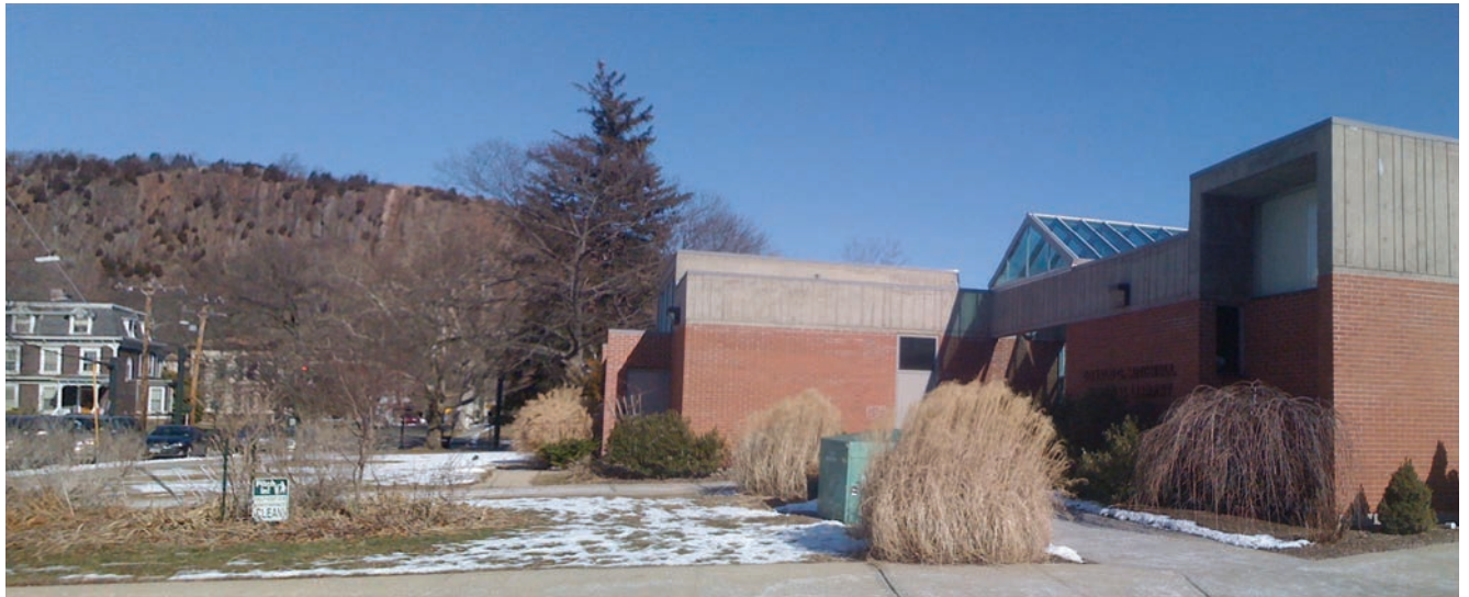
1. West view of the Harrison Street facade with entry at right, camera facing northeast. The glass roof is an addition in the 2003 renovation..

"Readability," Progressive Architecture , July 1966, p. 58.