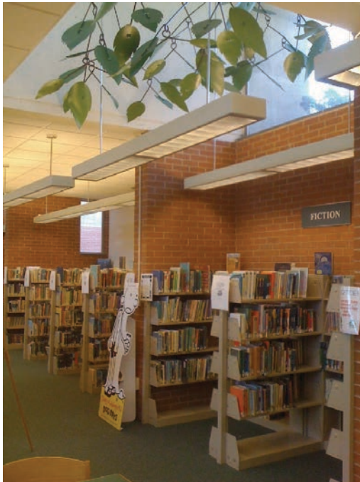
3. Interior of children's wing showing clerestory lighting.